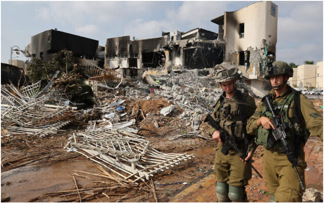
Soldiers walk in front of a police station that was damaged during battles to dislodge Hamas terrorists who were stationed inside, in the southern city of Sderot, on October 8, 2023.

The Israeli death toll from the Hamas onslaught against the Jewish state has surpassed 700 people, report Hebrew media outlets, citing health officials.