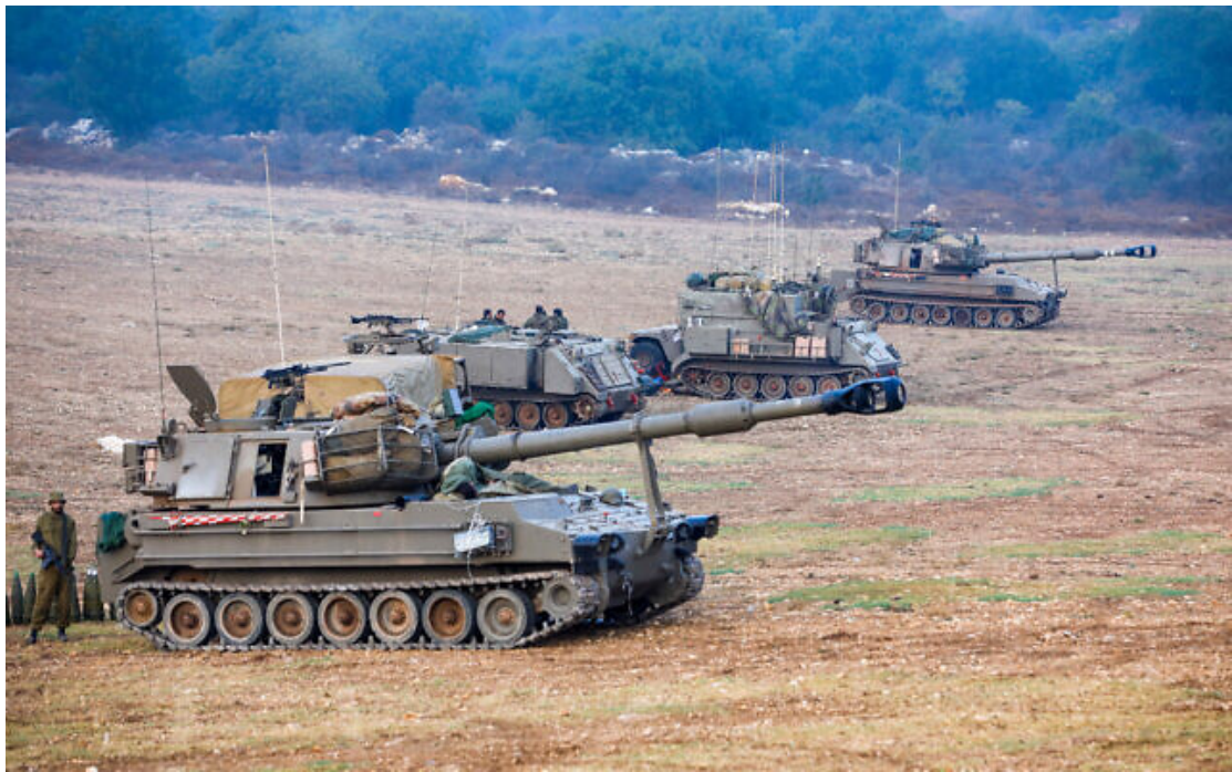
Israeli artillery at an undisclosed location in northern Israel bordering Lebanon on October 8, 2023.

A UN peacekeeping force deployed along Lebanon's southern border calls for "everyone to exercise restraint" and make use of the force's "liaison and coordination mechanisms to de-escalate" and prevent a fast deterioration of the security situation.