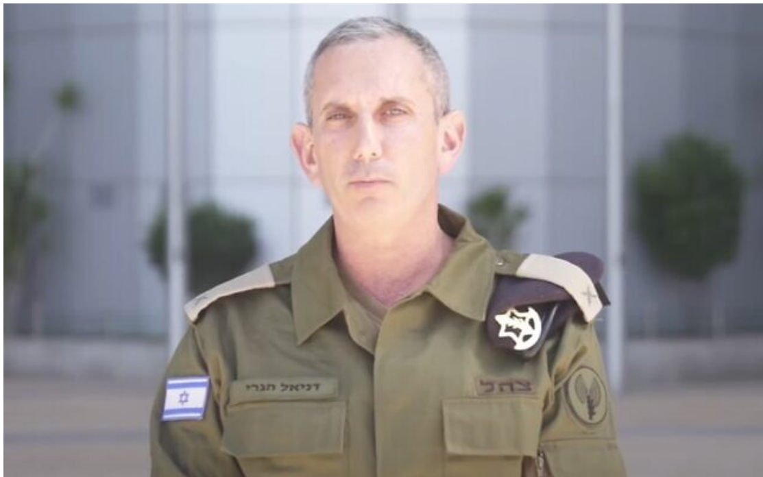
IDF spokesman Rear Admiral Daniel Hagari announces that Israel is at war, after a deadly mass Hamas infiltration from Gaza, October 7, 2023.

The Israel Defense Forces' top spokesman, Rear Adm. Daniel Hagari, says the Air Force carried out a major attack against Hamas assets in the northern Gaza Strip.