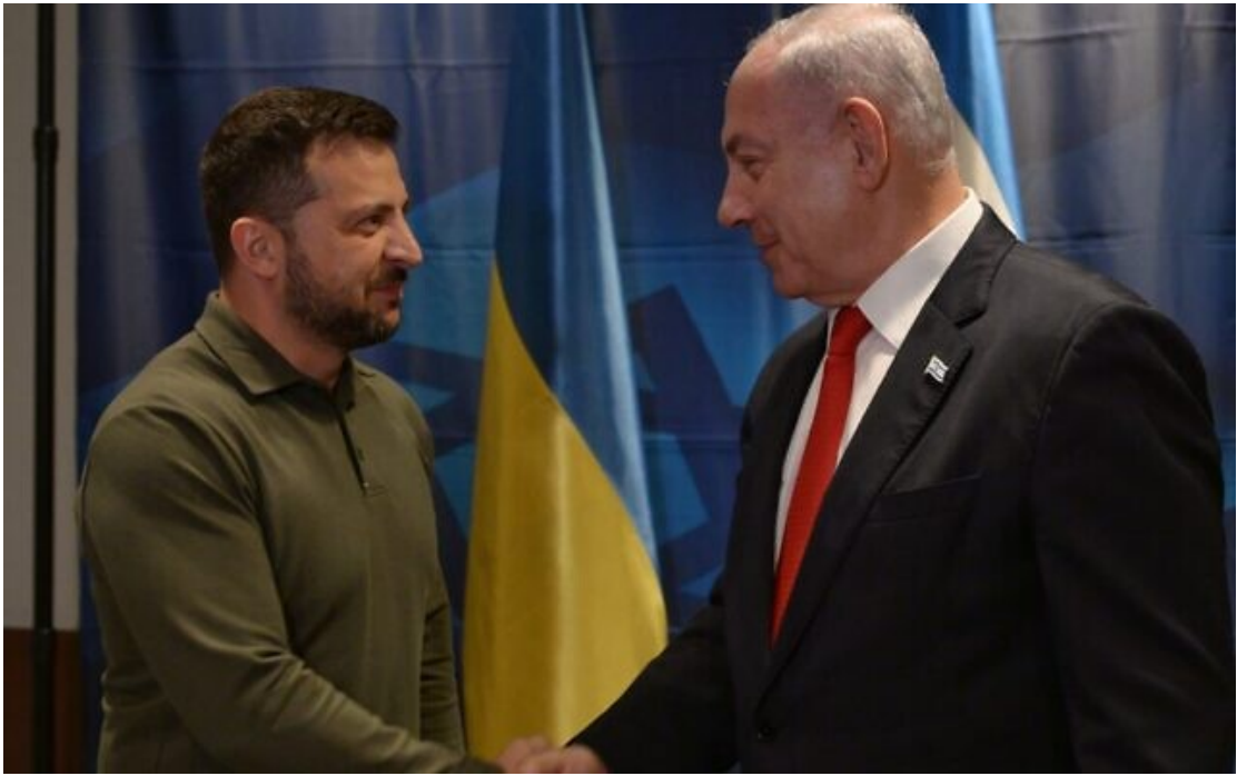
Prime Minister Benjamin Netanyahu (R) and Ukrainian President Volodymyr Zelensky meet on the UN General Assembly sidelines on September 19, 2023.

Ukrainian President Volodymyr Zelensky says that in his phone call with Benjamin Netanyahu earlier today, “the prime minister spoke about the situation in Israel and the actions of the armed forces and law enforcement agencies to repel the attack.”