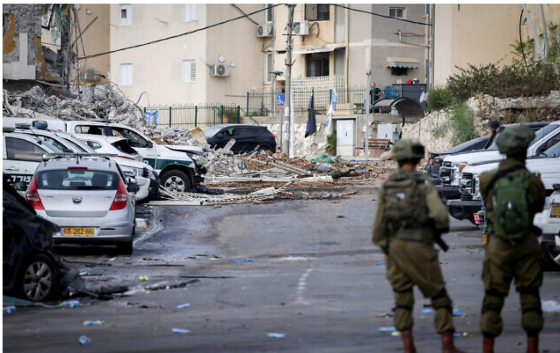
Israeli forces walk by a burned car and a collapsed building in the southern town of Sderot, October 8, 2023, following an assault by Hamas terrorists.

A Sderot resident riding an all-terrain vehicle in the southern city was shot and wounded by Israeli forces after refusing to halt, the municipality says.