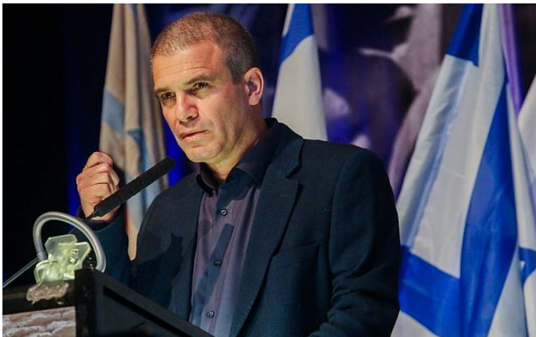
Former IDF brigadier general Gal Hirsch gives a press conference in Tel Aviv announcing his entry into politics, December 26, 2018.

Prime Minister Benjamin Netanyahu appoints Gal Hirsch, a reservist brigadier general who commanded the 91st Division in the 2006 Second Lebanon War, as the government's point man on missing and kidnapped citizens.