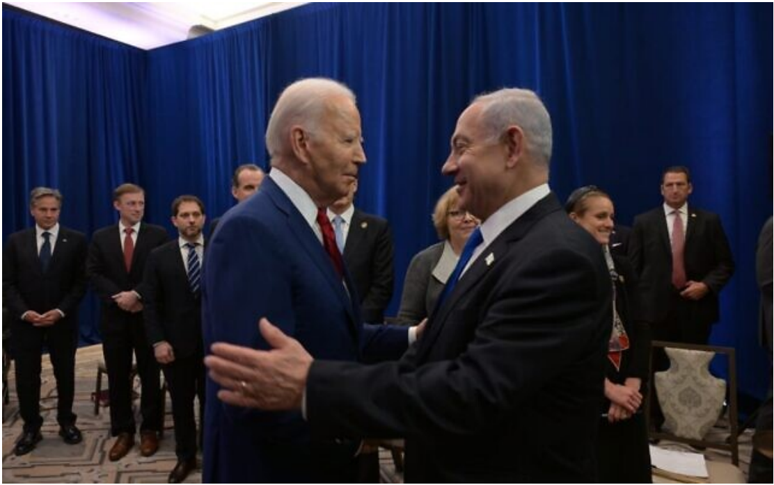
US President Joe Biden, left, meets with Prime Minister Benjamin Netanyahu on the sidelines of the 78th United Nations General Assembly in New York City on September 20, 2023.

Prime Minister Benjamin Netanyahu and US President Joe Biden speak by phone again.