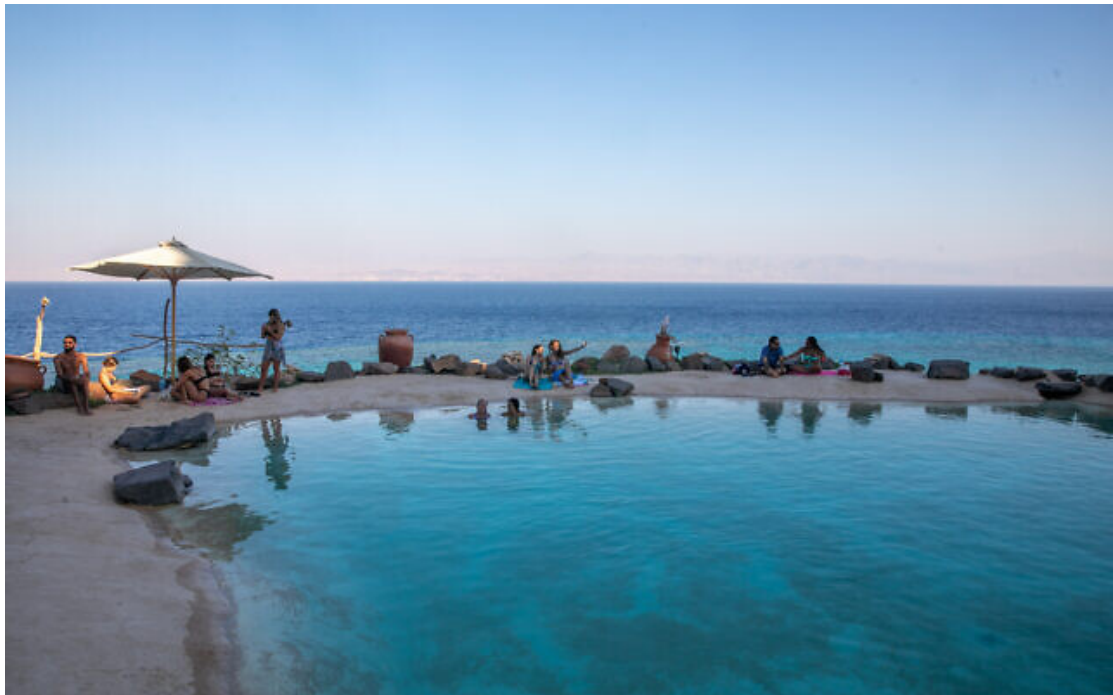
Illustrative. A resort in the Sinai Peninsula, Egypt, on October 4, 2021.

After today's deadly shooting in Egypt, the National Security Council urges Israelis in Sinai and Egypt to leave the country as soon as possible.