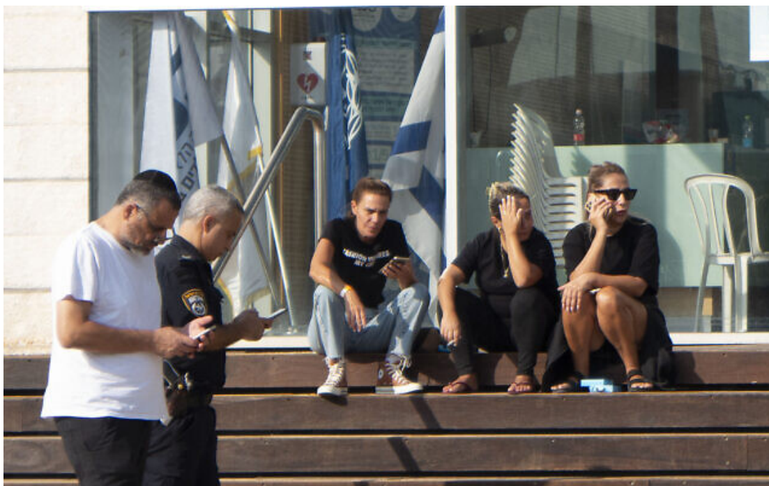
Three women smoke and talk outside a police missing persons unit near Tel Aviv, Israel on October 8, 2023.