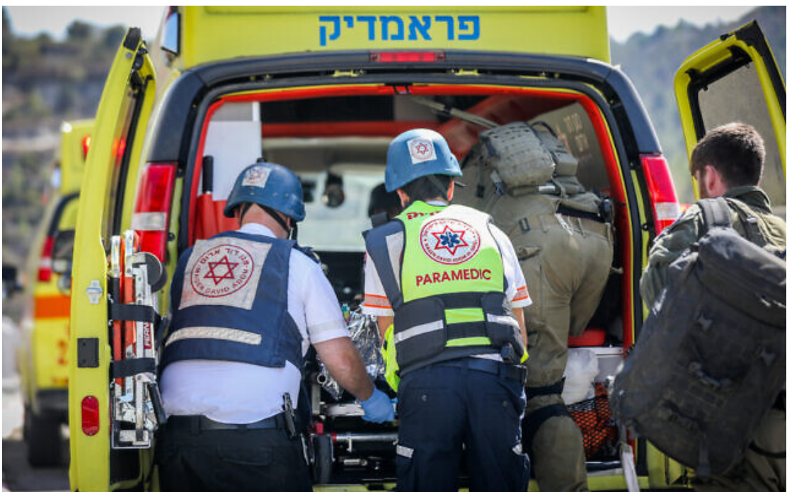
Wounded Israeli soldiers from the south arrive at the Hadassah Ein Kerem Hospital in Jerusalem, October 7, 2023.