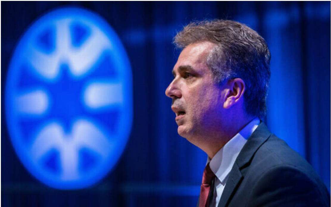
Foreign Minister Eli Cohen at a ceremony in the Foreign Ministry in Jerusalem, January 2, 2023.

Some 84 countries and nations have released statements supporting Israel, according to a list compiled by the Foreign Ministry.