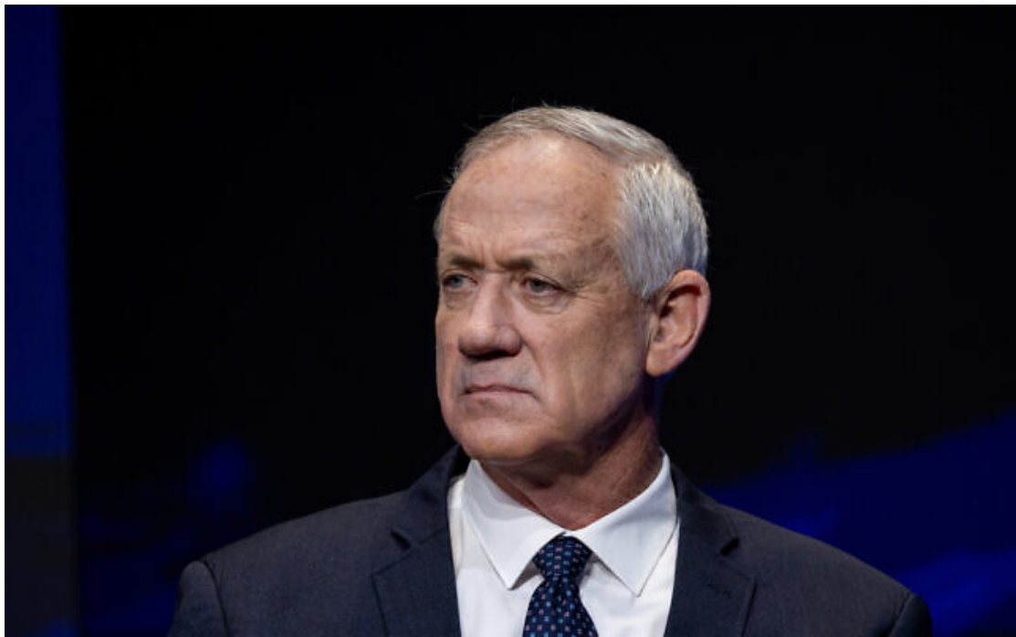
MK Benny Gantz attends an Israel Hayom conference in Jerusalem, September 6, 2023.

National Unity party leader and former defense minister Benny Gantz says he is willing to join the government in the wake of Hamas' assault on Israel, on condition that his party is given real influence in directing the war against the terror militia in Gaza.