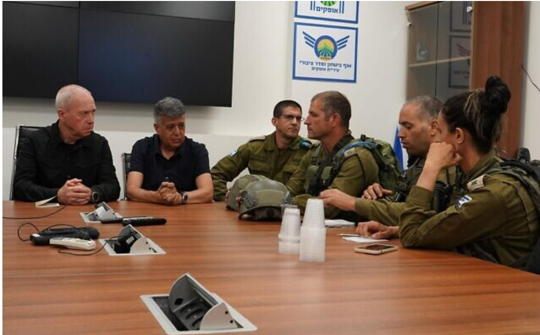
Defense Minister Yoav Gallant meets with Israeli forces in the southern city of Ofakim, October 8, 2023.

Defense Minister Yoav Gallant visits the southern town of Ofakim, which Hamas terrorists had breached yesterday and taken Israelis hostage.