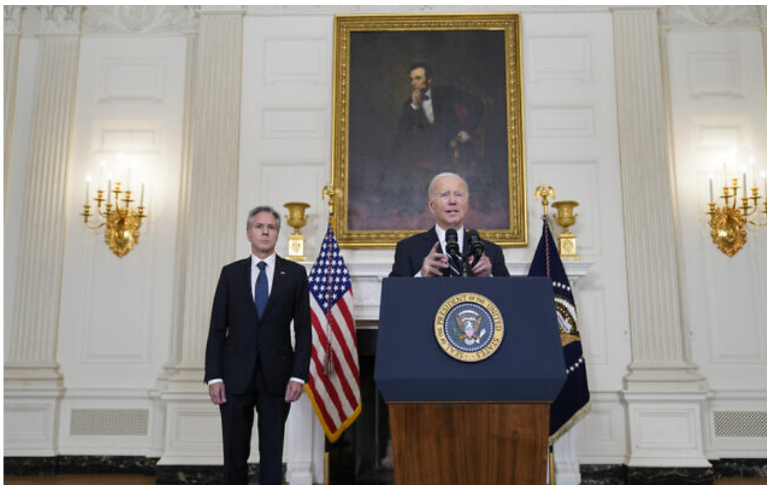
US Secretary of State Antony Blinken, left, listens as US President Joe Biden speaks in the State Dining Room of the White House, October 7, 2023, in Washington, about the situation in Israel.

The United States, a close ally and major supplier of arms to Israel, could announce later today new military support for the country following the Hamas attack, Secretary of State Antony Blinken says.