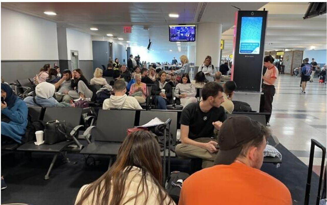
Israelis wait to fly to Tel Aviv on an El Al flight from JFK Airport in New York on October 8, 2023.