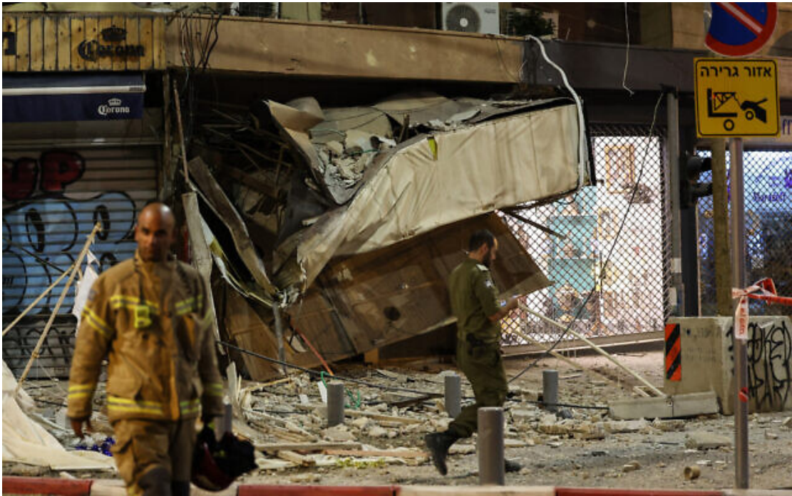
A rescuer walks in front of a damaged shop in Tel Aviv, after it was hit by a rocket fired by Palestinian terrorists from the Gaza Strip on October 7, 2023.

A rocket launched from the Gaza Strip has impacted an apartment building in the southern city of Netivot, footage shows.