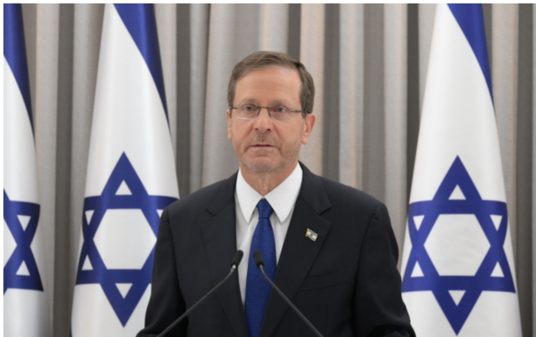
President Isaac Herzog speaks to the nation, October 8, 2023.

President Isaac Herzog urges national unity in his speech to the nation, saying “let us keep this spirit of heroism and this togetherness. It is our most powerful weapon.”