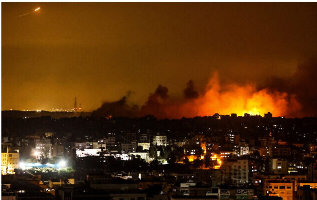
Fire and smoke rises during Israeli airstrikes in Gaza City, October 8, 2023.

The Israel Defense Forces says a fighter jet struck a Palestinian terrorist infiltrating into Israel from the Gaza Strip an hour ago.