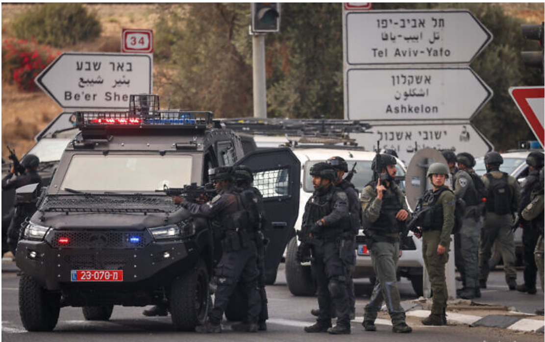
Israeli forces outside the entrance to the southern Israeli town of Sderot, October 8, 2023.

The Israel Defense Forces instructs residents of Kibbutz Mefalsim and the city of Sderot, close to the border with the Gaza Strip, to remain in their homes until further notice.