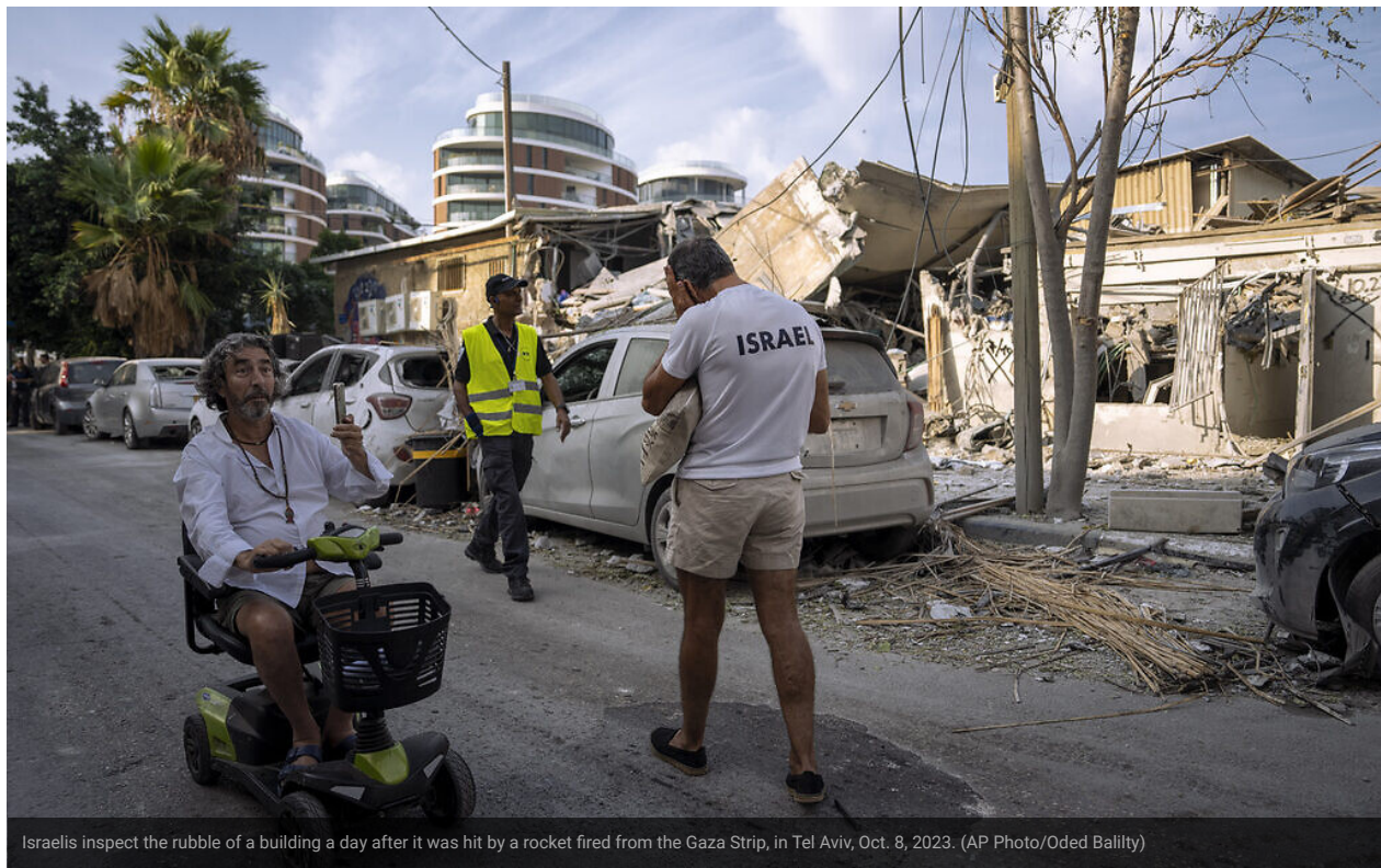
Israelis inspect the rubble of a building a day after it was hit by a rocket fired from the Gaza Strip, in Tel Aviv, Oct. 8, 2023.