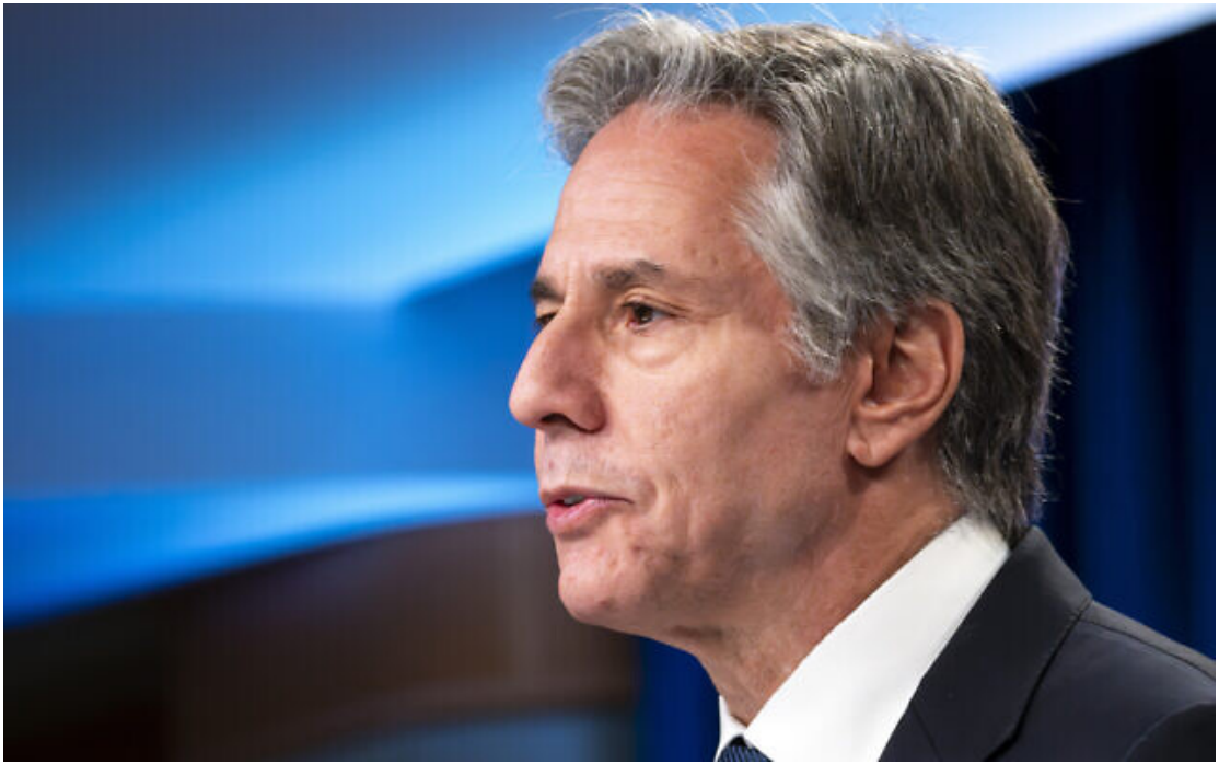
US Secretary of State Antony Blinken speaks during a media briefing at the State Department, August 15, 2023, in Washington.

US Secretary of State Antony Blinken spoke to Qatari Prime Minister and Foreign Minister Mohammed Bin Abdulrahman Al Thani to condemn the “appalling terrorist attacks on Israel,” and reiterate “Israel’s right to self-defense,” his office says. and