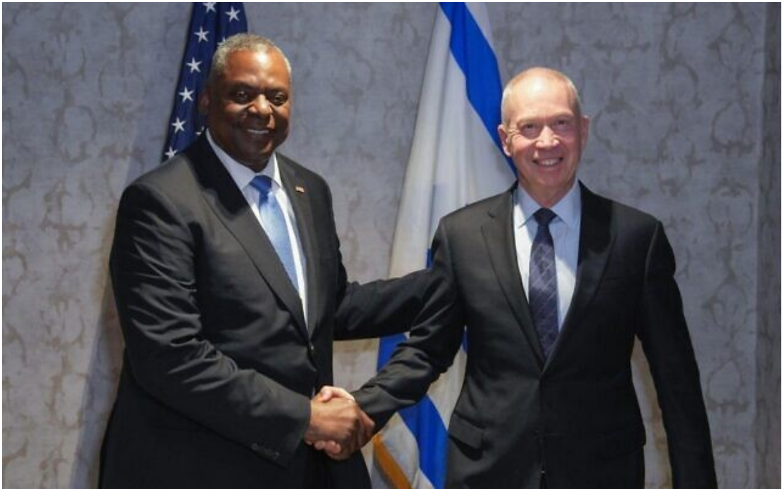
US Defense Secretary Lloyd Austin (L) and Defense Minister Yoav Gallant meet in Brussels on June 15, 2023.

Defense Minister Yoav Gallant speaks again with his US counterpart, Lloyd Austin, his office says.