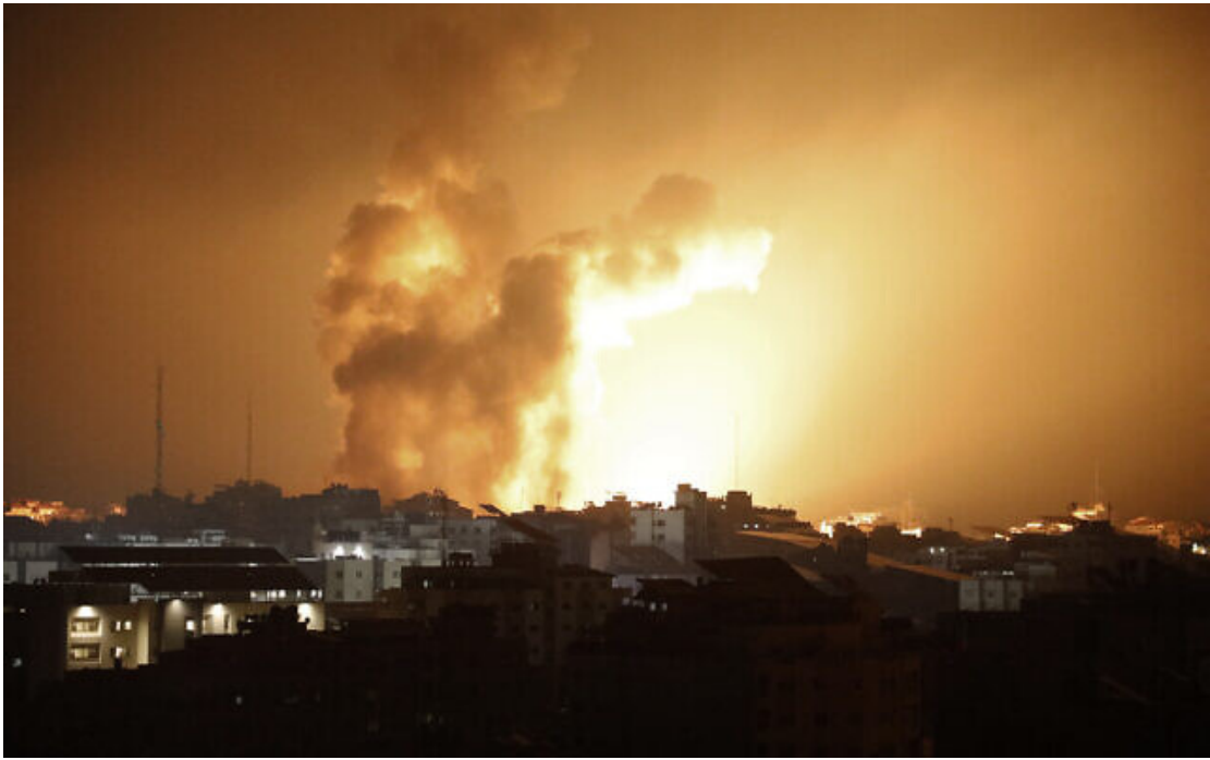
Fire and smoke rises above buildings during an Israeli air strike in Gaza City on October 8, 2023.

The Hamas-run health ministry in the Gaza Strip says 256 Palestinians have been killed and another 1,788 have been wounded in the Gaza Strip.