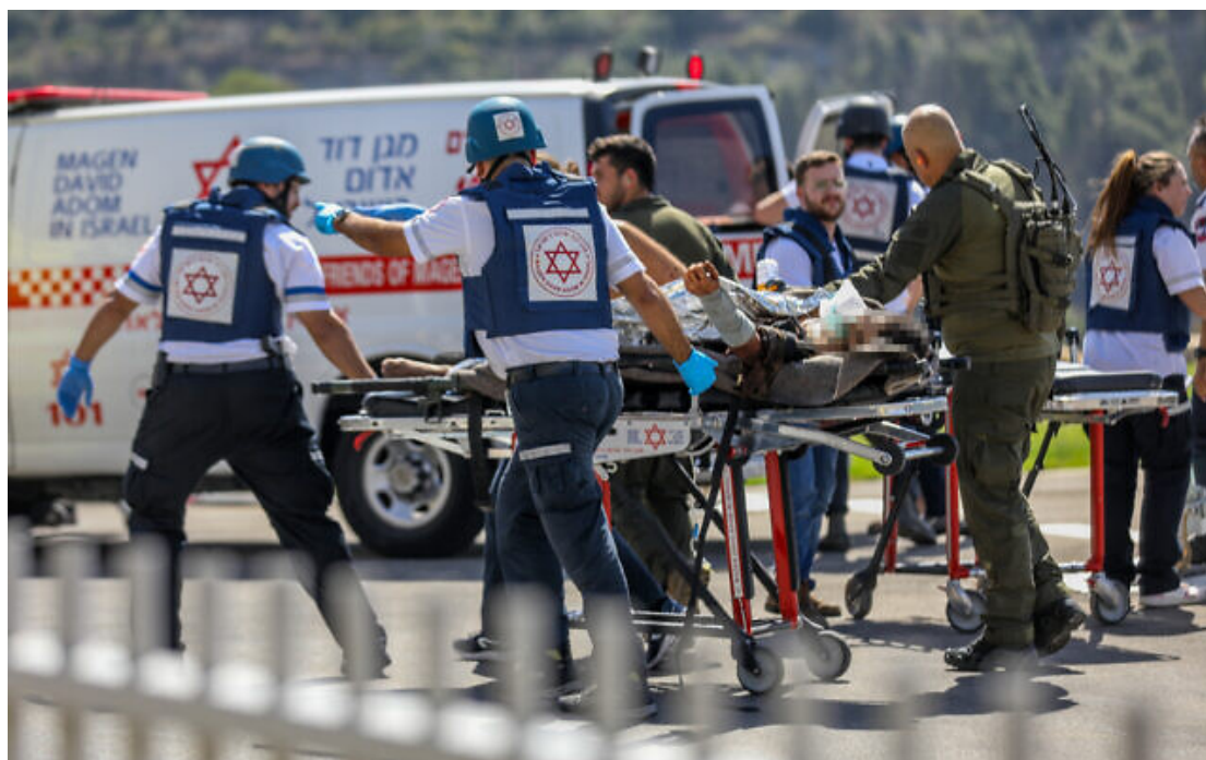
Wounded Israeli soldiers from the south arrive to the Hadassah Ein Kerem Hospital in Jerusalem, October 7, 2023.

The death toll from the massive assault launched by Hamas on Israeli communities near Gaza and thousands of rockets fired into Israel is over 500, officials estimate.