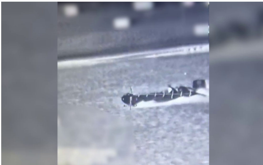
Israeli Navy ships fire at Hamas terrorists attempting to infiltrate into Israel, early October 7, 2023.

The Israel Defense Forces says the Navy's Shayetet 13 unit has taken into custody the deputy commander of the southern division of the Hamas naval force in Gaza, Muhammad Abu Ghali.