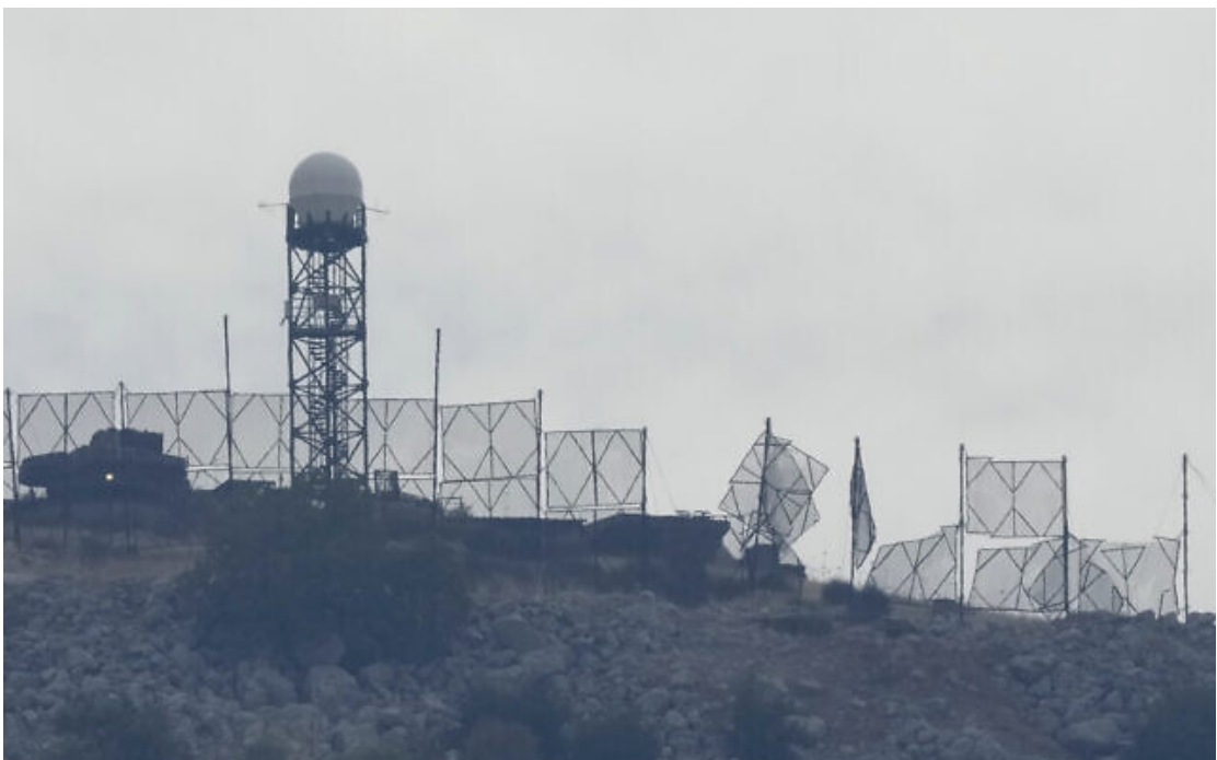
The fence of an Israeli military position is seen damaged after Hezbollah targeted it by rockets on Mount Dov on the Lebanese border, Oct. 8, 2023.