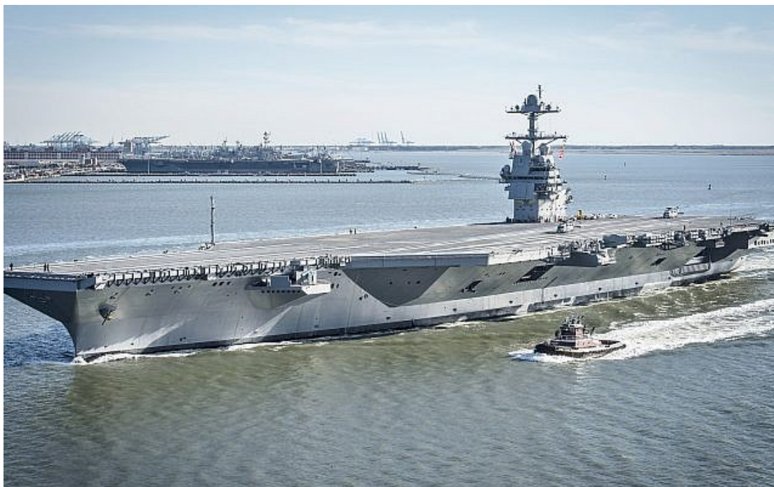
The USS Gerald R. Ford.

The United States will provide munitions and equipment to Israel and boost American forces in the Middle East, in response to the attacks by Hamas, the Pentagon says.