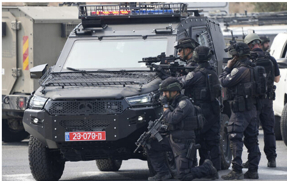
Israeli police deploy near Ashkelon, Israel, on October 8, 2023.

Police publish footage of Border Police officers fighting Hamas terrorists in southern Israel and rescuing Israeli civilians under fire.