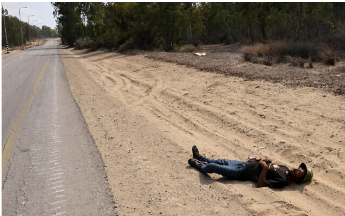
A corpse of a Palestinian terrorist lies along a road in an undisclosed location on the border with the Gaza Strip on October 8, 2023.

The Israel Defense Forces says it is still fighting Palestinian terrorists in Israeli territory, 40 hours into the war launched by the Hamas terror group.