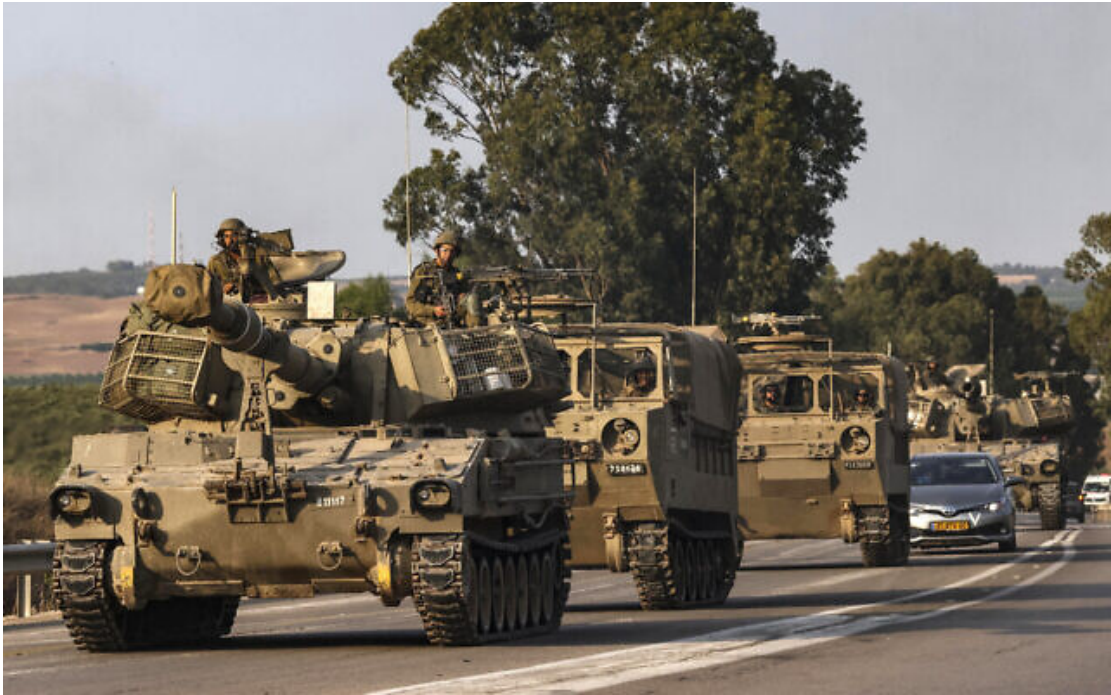
An Israeli self-propelled howitzer rolls on a highway near the southern city of Sderot on October 8, 2023.

There is a suspected terrorist infiltration into the southern city of Sderot, the municipality says.