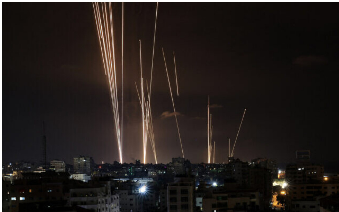
A salvo of rockets is fired by Palestinian terrorists from the Gaza City toward Israel on October 7, 2023.

A report in the Wall Street Journal claims that Iran helped Hamas plan its attack on Israel during a meeting in Beirut last week, and has been working on it for weeks.