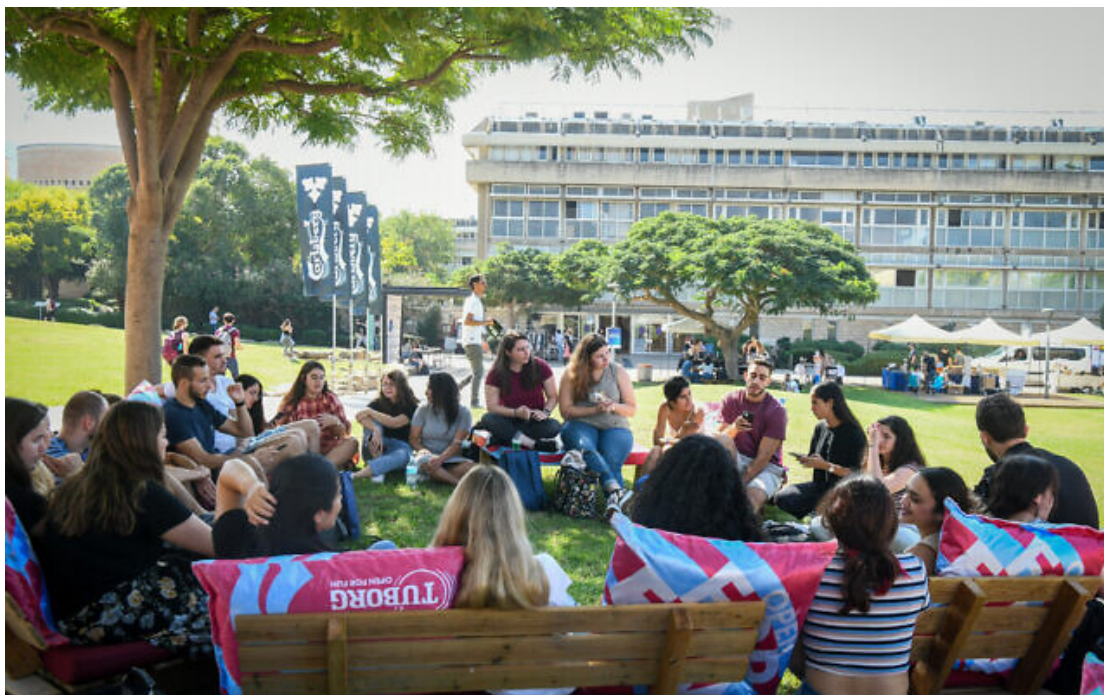
Students at Tel Aviv University on the first day of the academic year, October 10, 2021.

The new academic school year at Israeli universities will begin on October 22, instead of October 15, the Committee of University Presidents announces.