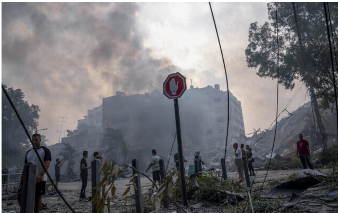
Palestinians inspect the rubble of a building after it was struck by an Israeli airstrike, in Gaza City, October 8, 2023.

Two Mexicans, a man and a woman, are believed to be held hostage by Hamas in Gaza, Mexico's Foreign Minister Alicia Bárcena says.