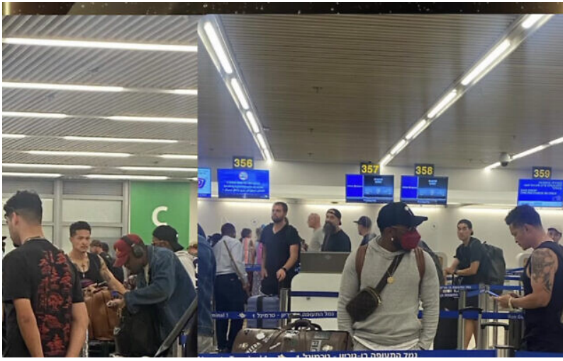
Bruno Mars and his crew seen lining up to leave Israel after Hamas launched an attack on October 7, 2023