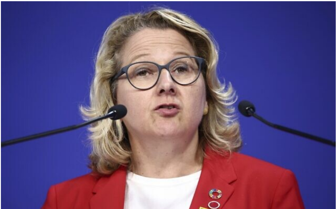
Germany's Minister for Economic Cooperation and Development Svenja Schulze speaks in London, June 22, 2023.

Germany's development minister says her country will review its aid for the Palestinian areas following the attack by Hamas on Israel.