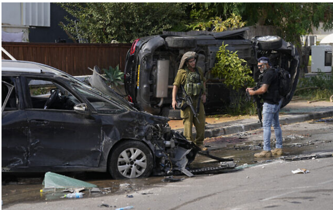
Israeli policeman and a soldier in Sderot, Israel, Sunday, Oct. 8, 2023.

The Magen David Adom ambulance service says its medics are treating four people wounded in the latest rocket barrage from the Gaza Strip in the Sderot area.