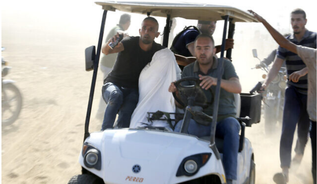
Palestinians terrorists transport an abducted Israeli civilian from Kibbutz Kfar Azza into the Gaza Strip on October 7, 2023.

The Israel Defense Forces says it has established a situation room to focus on putting together accurate information regarding the Israeli hostages held by the Hamas terror group in the Gaza Strip.