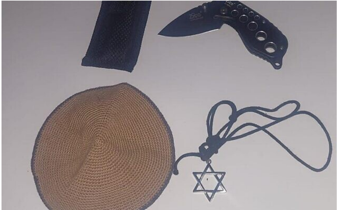
A knife, kippa and Star of David necklace recovered from two suspects arrested near a synagogue outside in Jerusalem on October 8, 2023.

Two suspects — Palestinian residents of East Jerusalem — were arrested near a synagogue in the Pisgat Ze'ev neighborhood of Jerusalem, holding a knife, police say.