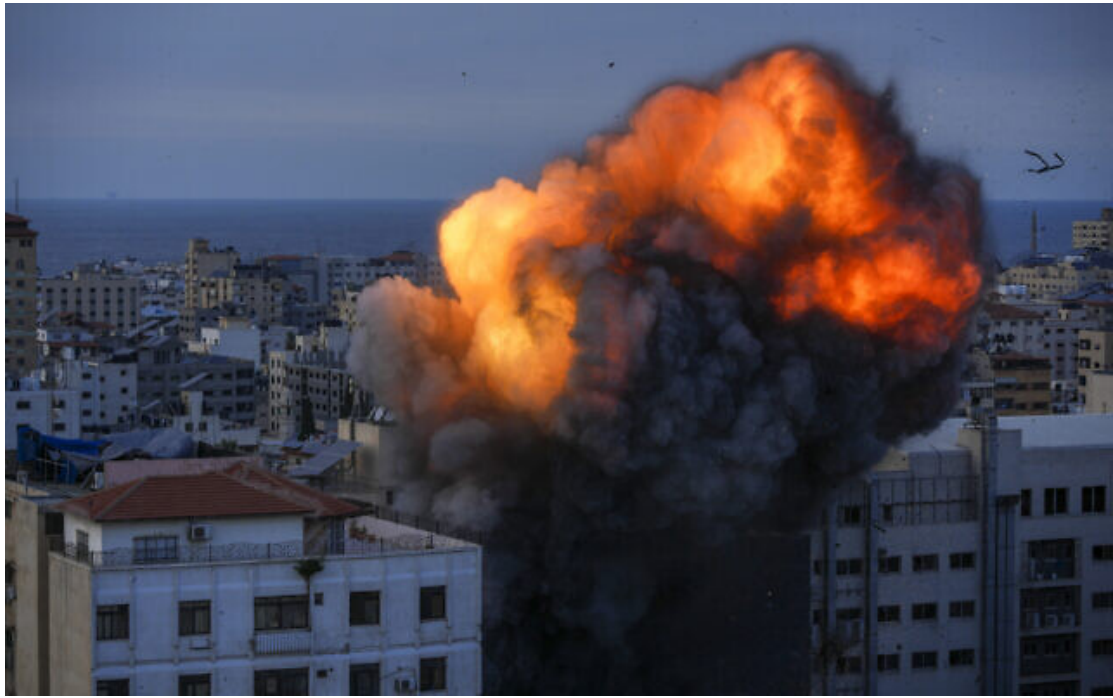
Fire and smoke rise following an Israeli airstrike, in Gaza City, October 8, 2023.

The Israel Defense Forces says it is carrying out a new wave of airstrikes in the Gaza Strip.