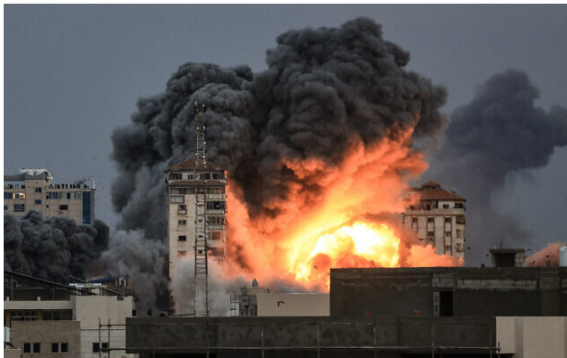
A ball of fire and smoke rises above a building in Gaza City on October 7, 2023 during an Israeli air strike.

The Hamas-run health ministry in the Gaza Strip says 313 Palestinians have been killed and another 1,990 have been wounded in the Gaza Strip.