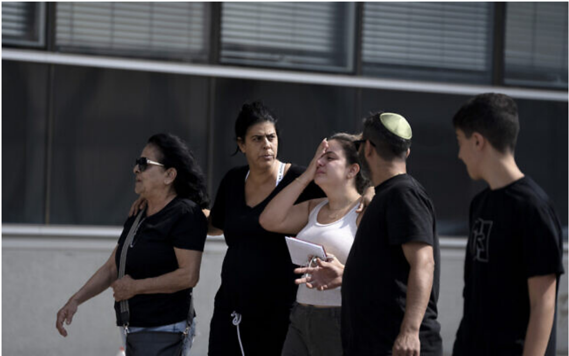
A family arrives to a police station in Lod, to provide DNA samples to help identify a relative missing since an unprecedented mass terror attack by Hamas, in southern Israel, October 8, 2023.

US Secretary of State Antony Blinken says on CNN's "State of the Union" that "We have reports that several Americans were killed."