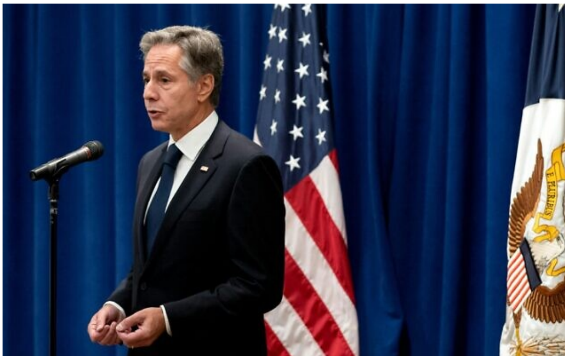
US Secretary of State Antony Blinken speaks during a news conference as he announces that five Americans who had been jailed for years in Iran have been freed, in New York City on September 18, 2023.