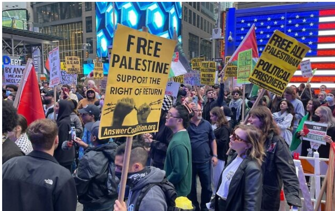
Pro-Palestinian protesters gather in Times Square in New York City on October 8, 2023.

Several hundred pro-Palestinian demonstrators rally in support of the Hamas terror attack on Israel in New York City's Times Square.