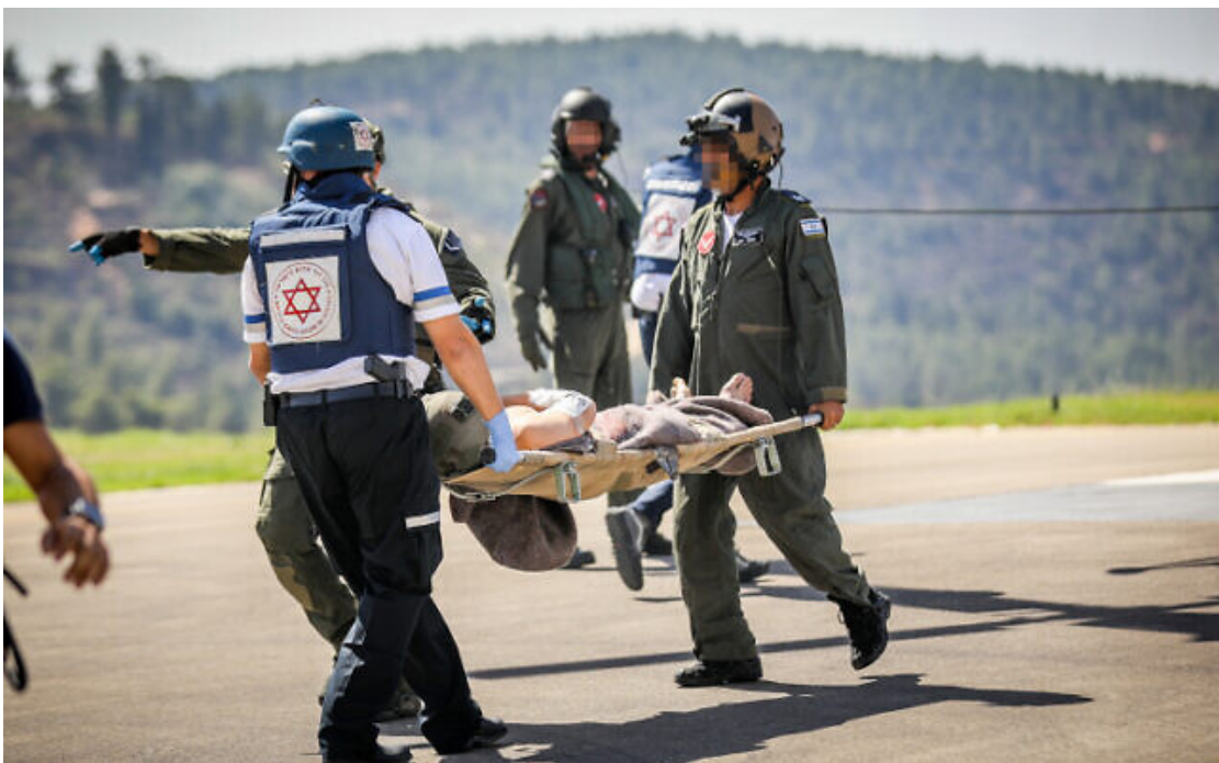
Wounded Israeli soldiers arrive at the Hadassah Ein Kerem Hospital in Jerusalem, October 7, 2023.