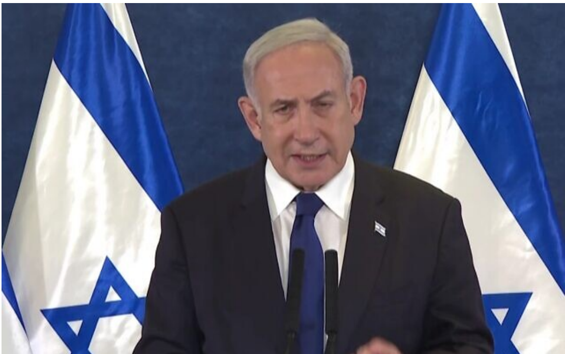
Prime Minister Benjamin Netanyahu delivers a televised address on October 7, 2023.