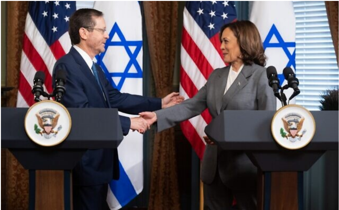
US Vice President Kamala Harris shakes hands with President Isaac Herzog as they speak to the media prior to a meeting at the Eisenhower Executive Office Building in Washington, July 19, 2023.

President Isaac Herzog speaks with US Vice President Kamala Harris.