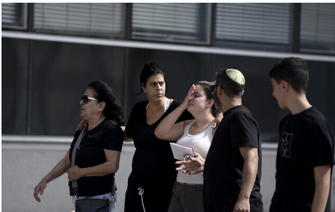
A family arrives to a police station in Lod, to provide DNA samples to help identify a relative missing since an unprecedented mass terror attack by Hamas, in southern Israel, October 8, 2023.