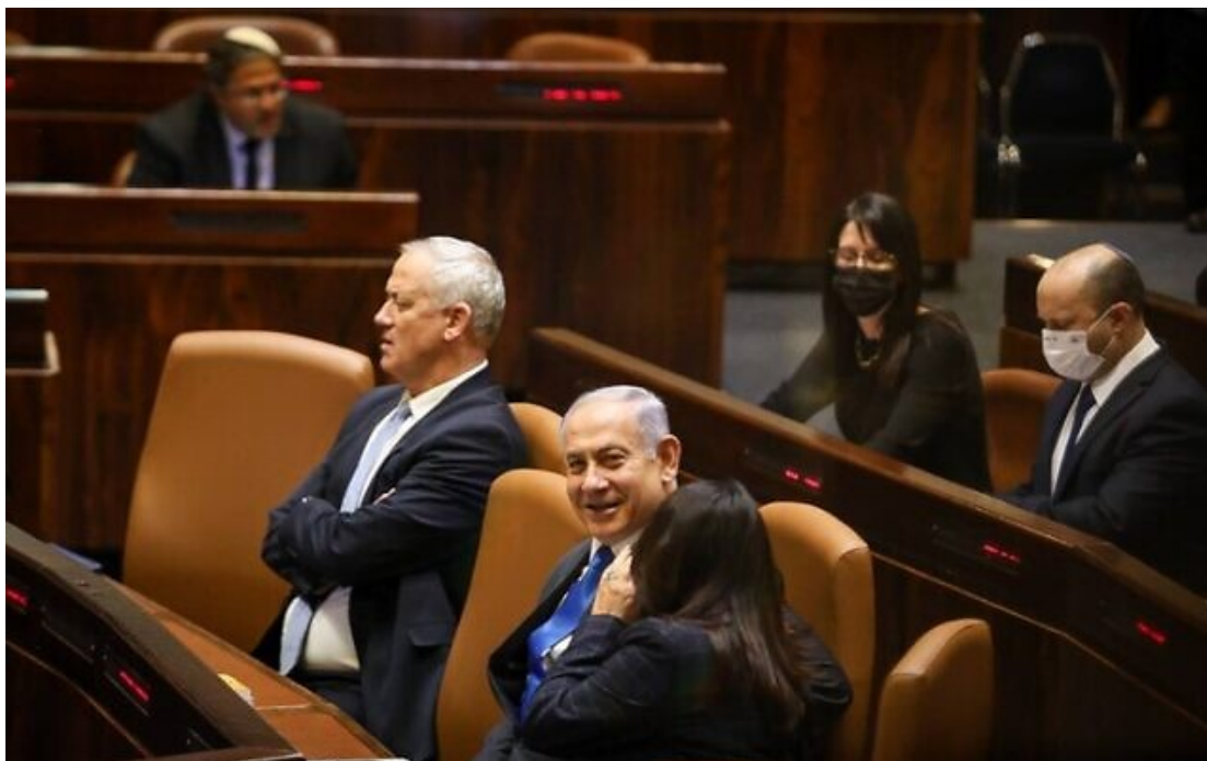
Then-defense minister Benny Gantz and then-outgoing prime minister Benjamin Netanyahu, in the Knesset plenum, June 13, 2021.

Lawyers for Prime Minister Benjamin Netanyahu and National Unity party leader Benny Gantz are expected to meet tomorrow, in an attempt to hash out the details of an emergency unity government.