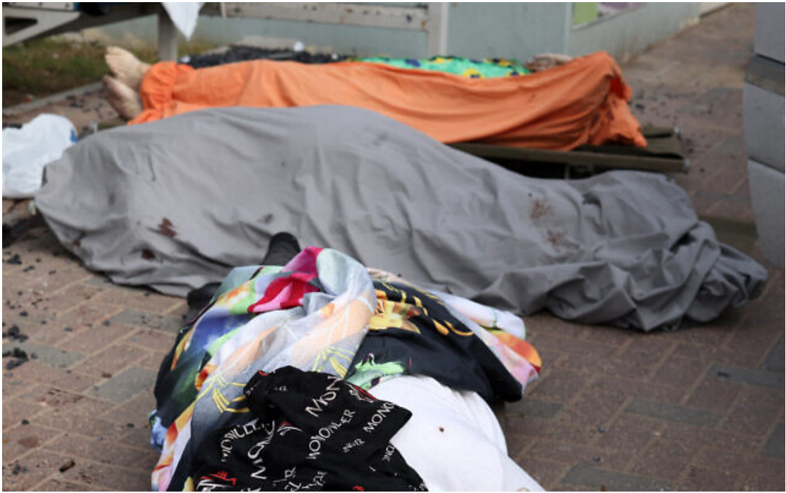
Graphic content: The bodies of Israeli civilians lie covered in the southern city of Sderot on October 7, 2023, amid an unprecedented infiltration into Israel by hundreds of gunmen from the Hamas terrorist organization from Gaza.

The estimated death toll from the Hamas assault on Israeli border communities jumps sharply this afternoon from 300 this morning to some 600.