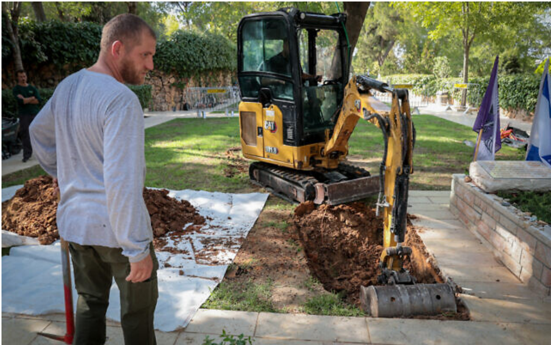
Graves being prepared at the Mount Herzl military cemetery in Jerusalem, October 8, 2023.

The Israel Defense Forces names another 13 soldiers killed in southern Israel during fighting with the Hamas terror group over the past day.