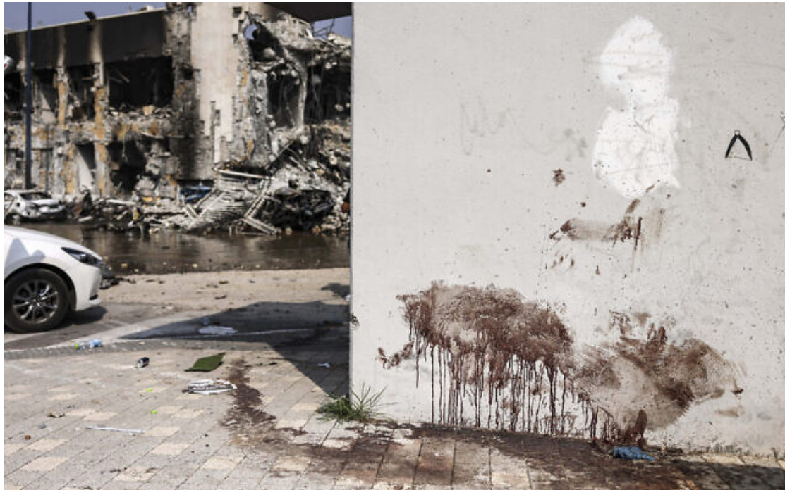
Blood stains a wall at a police station in the southern city of Sderot after it was damaged during battles to dislodge Hamas terrorists who were stationed inside, on October 8, 2023.

Palestinian Islamic Jihad leader Ziyad Nakhaleh releases a statement claiming that the group is holding more than 30 of the Israeli hostages currently in Gaza.