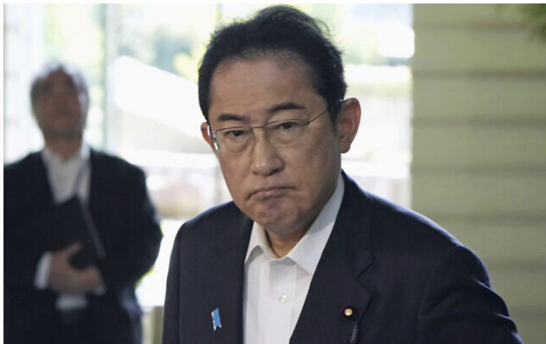
Japan’s Prime Minister Fumio Kishida meets the journalists about North Korea’s missile launch, at his office in Tokyo, July 25, 2023.

Japan’s Prime Minister Fumio Kishida condemns Hamas and other Palestinian terrorists over their incursion into Israel, urging all parties to use restraint.