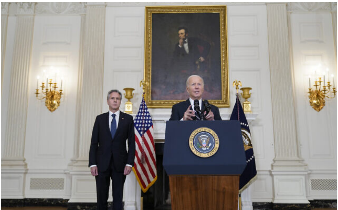
US Secretary of State Antony Blinken, left, listens as US President Joe Biden speaks in the State Dining Room of the White House, October 7, 2023, in Washington, about the situation in Israel.