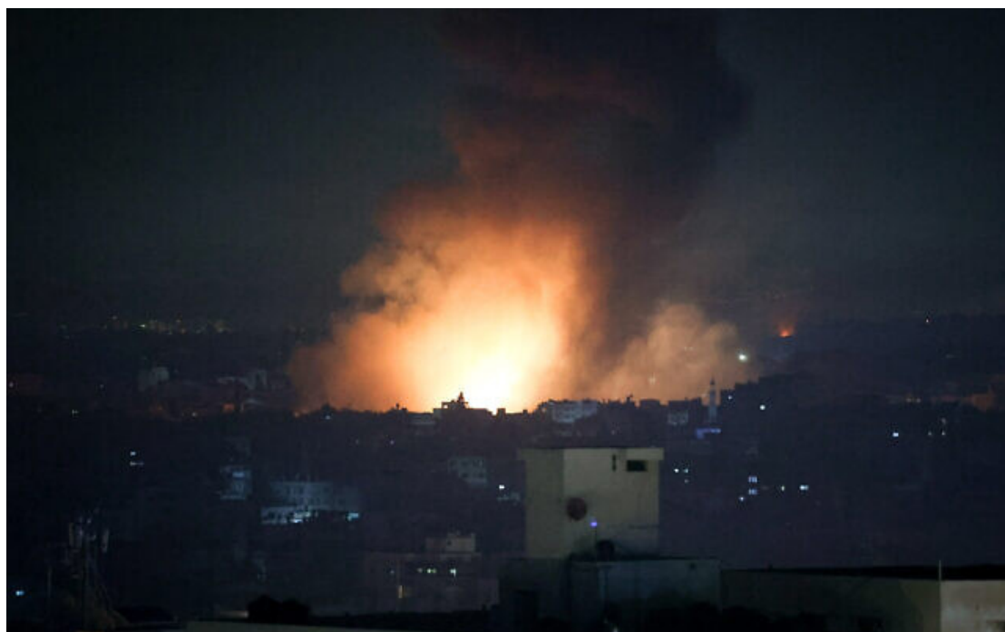
Smoke rises after Israeli air strikes near the border east of the city of Rafah in the southern Gaza Strip, October 8, 2023.

The Israel Defense Forces says dozens of fighter jets are carrying out a wave of “intense” airstrikes in the Gaza Strip.