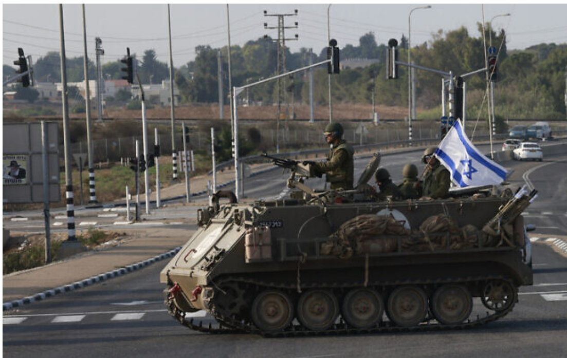
Israeli forces cross a main road in an armored personnel carrier (APC) as additional IDF troops are deployed near the southern city of Sderot following an assault by Hamas terrorists, October 8, 2023.

Gunfire is reported heard near Kibbutz Karmia, close to the northern border with the Gaza Strip.