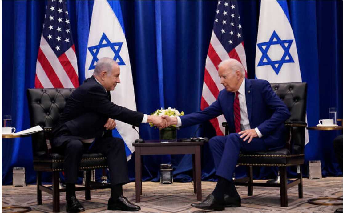
US President Joe Biden meets with Prime Minister Benjamin Netanyahu in New York, September 20, 2023.

Prime Minister Benjamin Netanyahu and US President Joe Biden are expected to speak again this evening, an official in the Prime Minister's Office tells The Times of Israel.