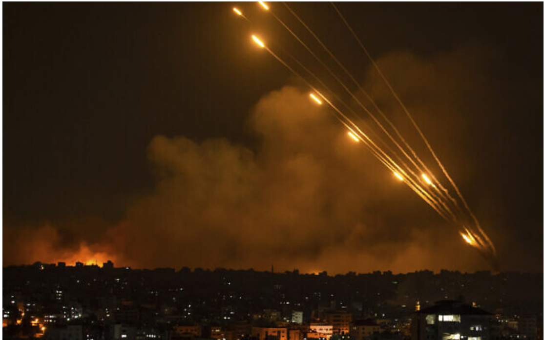
Rockets are fired toward Israel from the Gaza Strip, October 8, 2023.

Fresh rockets have been fired from Gaza toward Ashkelon just minutes after an earlier barrage, including reports of direct impacts.