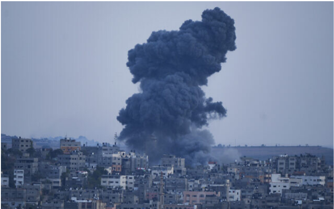
Smoke rises following an Israeli airstrike, in Gaza City, October 8, 2023.

The Hamas-run health ministry in the Gaza Strip says 413 Palestinians have been killed and another 2,300 have been wounded in the Gaza Strip.