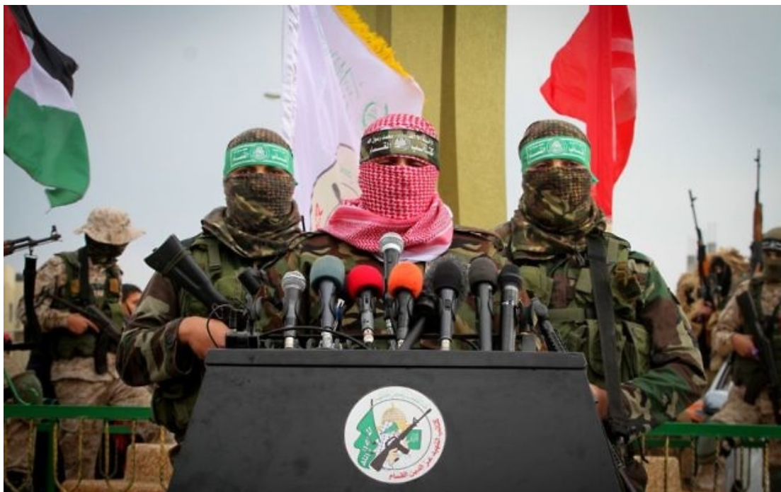
Abu Ubaida, spokesman of the Izz ad-Din al-Qassam Brigades, the military wing of the Palestinian Islamist movement Hamas, speaks during a memorial in the southern Gaza Strip town of Rafah on January 31, 2017.

In a speech, Abu Ubaida, spokesman for the Izz ad-Din al-Qassam brigades, the military wing of Hamas, claims that fighting is still ongoing in several areas near the northern Gaza border, including Zikim, Sufa, and Mefalsim, and that terrorists managed to take a new group of Israeli hostages into the Gaza strip today.