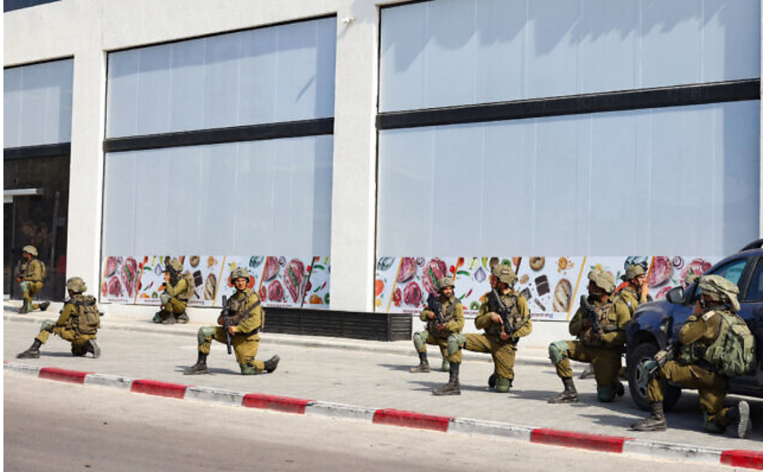
Israeli soldiers deploy in an area where civilians were killed in the southern city of Sderot on October 7, 2023.