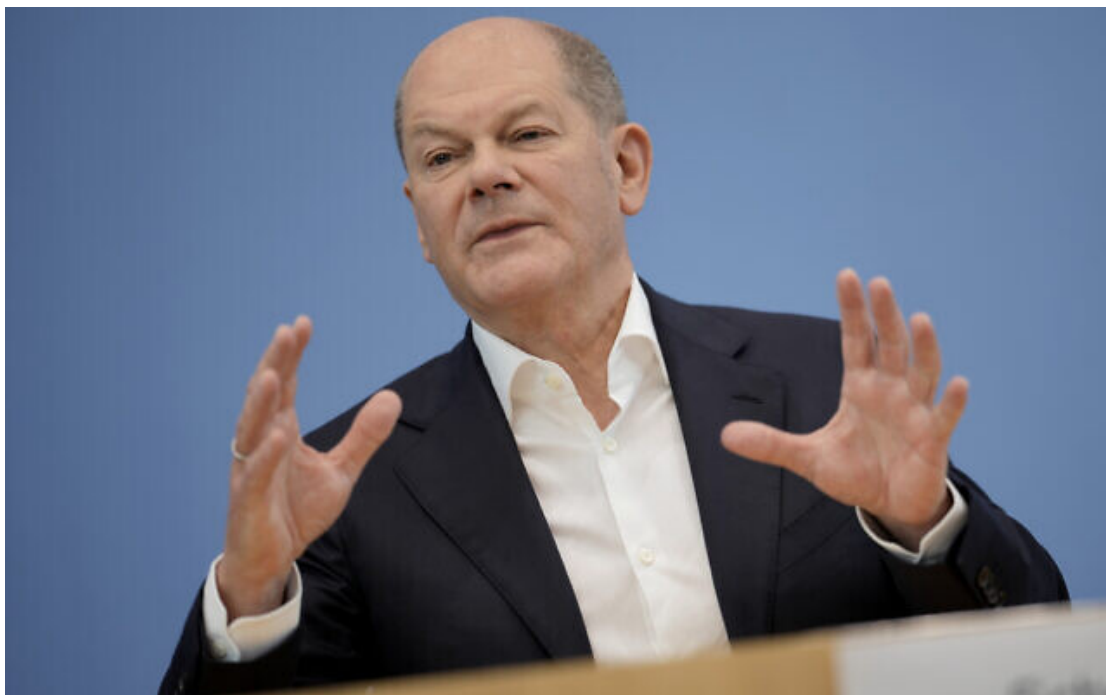
German Chancellor Olaf Scholz speaks during his annual summer press conference in Berlin, Germany, July 14, 2023.

German Chancellor Olaf Scholz stresses the need to avoid a wider “conflagration” in the Middle East after Hamas attacked Israel.