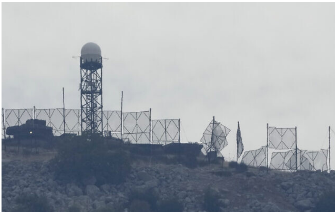
The fence of an Israeli military position is seen damaged after Hezbollah targeted it by rockets on Mount Dov on the Lebanese border, Oct. 8, 2023.

The Israel Defense Forces says it fired warning shots toward Hezbollah members who were attempting to rebuild the tent on the Lebanon border after it was bombed earlier in response to a mortar attack.