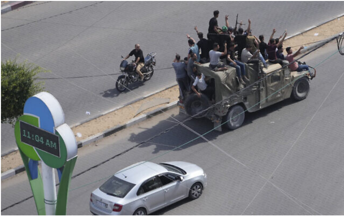
Palestinians drive a captured Israeli military vehicle in Gaza City on Oct. 7, 2023.

Reports have been circulating that Egypt has been working to attempt to free some of the Israeli captives being held in Gaza.