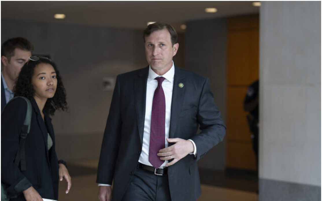
Rep. Dan Goldman, D-New York, arrives to speak with reporters in Washington, July 31, 2023.

US Rep. Dan Goldman and his family were in Tel Aviv when Hamas attacked Israel yesterday and were forced to shelter in a hotel stairwell until this morning, when they could safely leave the country, according to his office.