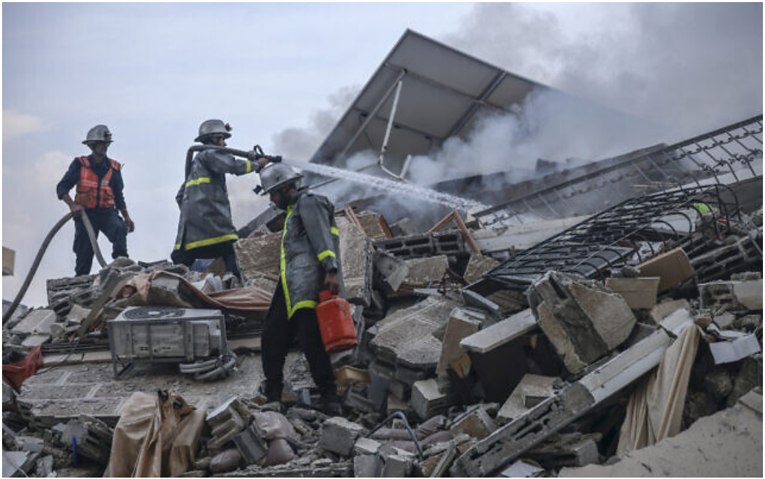
Palestinian firemen extinguish a fire that was raging in a building destroyed by Israeli airstrikes in Gaza City on October 8, 2023.

The UN agency for Palestinian Refugees, UNRWA, says over 20,000 people are sheltering in 44 of its schools around Gaza.