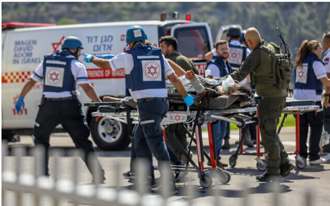
Wounded Israeli soldiers from the south arrive to the Hadassah Ein Kerem Hospital in Jerusalem, October 7, 2023.

The Health Ministry updates the number of Israelis wounded and hospitalized from the Hamas assault to 1,864.