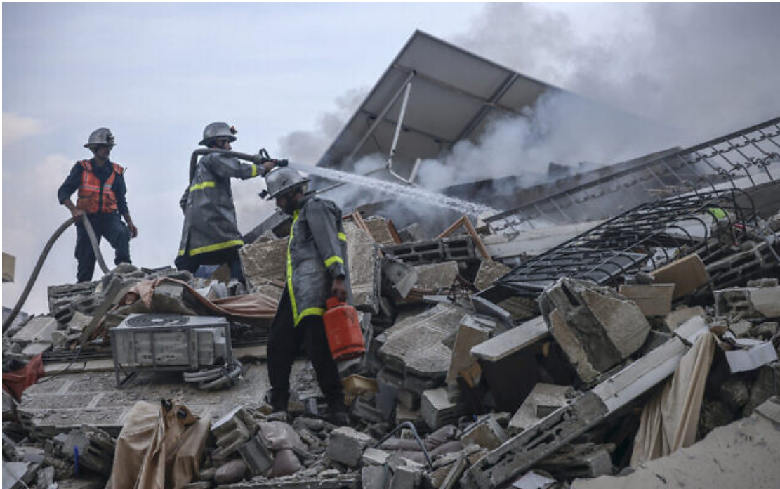
Palestinian firemen extinguish a fire that was raging in a building destroyed by Israeli airstrikes in Gaza City on October 8, 2023.

The Israel Defense Forces' top spokesman, Rear Adm. Daniel Hagari, says the military killed more than 400 Palestinian terrorists in southern Israel and the Gaza Strip, and captured dozens more, during the fighting that began yesterday.