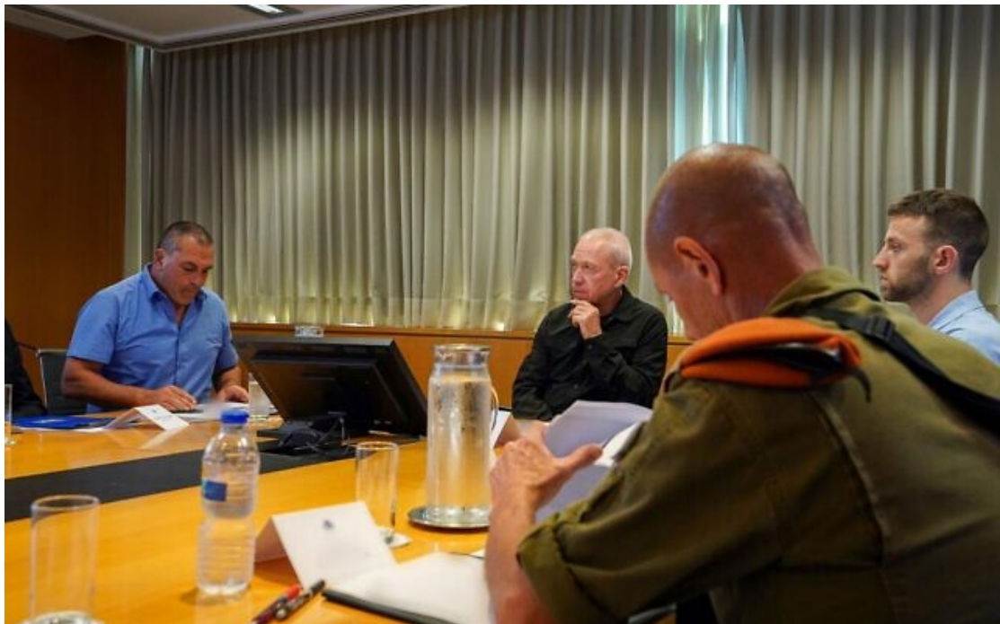
Defense Minister Yoav Gallant holds an assessment at his office in Tel Aviv, October 8, 2023.