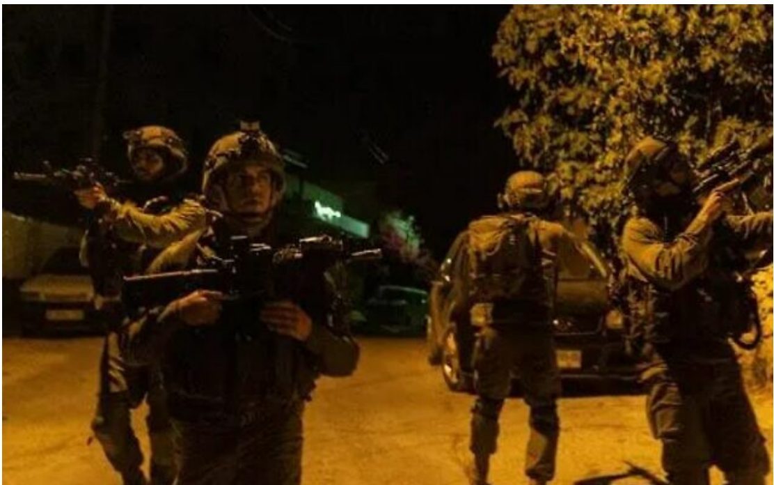
IDF troops regain control of Kibbutz Be'eri in Israel on October 8, 2023.