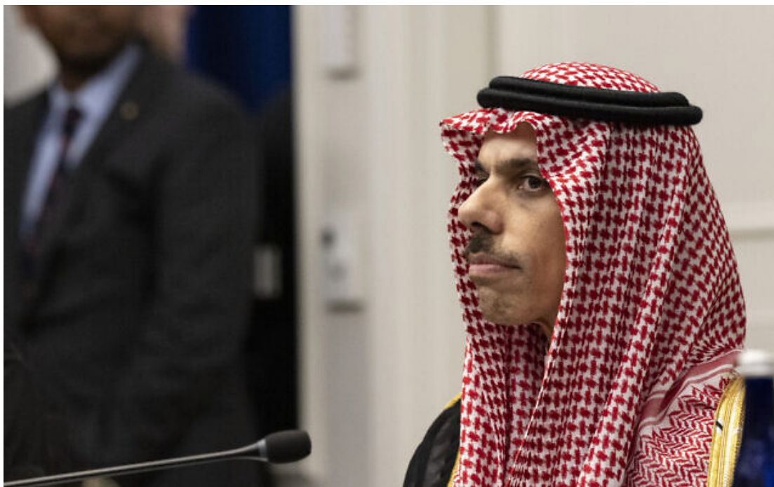
Saudi Arabia Foreign Minister Prince Faisal bin Farhan Al Saud attends a meeting with US Secretary of State Antony Blinken and United Arab Emirates Foreign Minister Abdullah bin Zayed Al Nahyan on the sidelines of the 78th United Nations General Assembly, September 19, 2023.

The United Arab Emirates calls to end the violence and protect civilians in the ongoing war between Israel and Hamas.