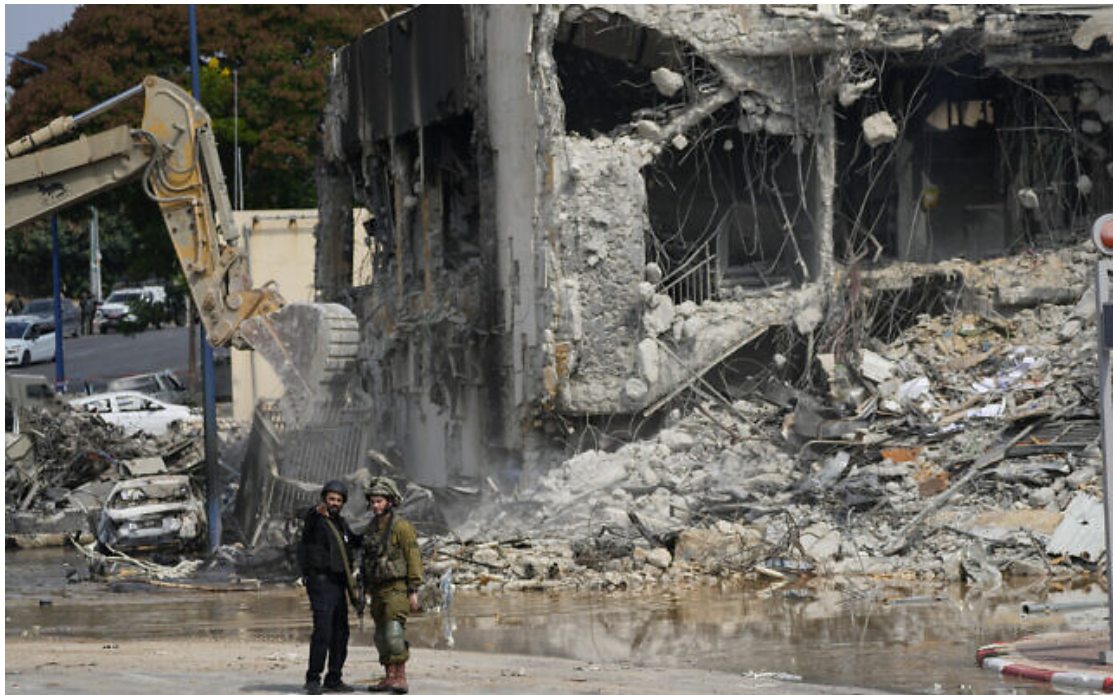
An Israeli digger removes the rubble from the police station that was overrun by Hamas terrorists on Saturday, in Sderot, Israel, and recaptured Sunday, October 8, 2023.

A French woman in Israel has died “in the context of the terrorist attacks,” France’s foreign ministry says, without providing details. French teams in Israel and Paris are trying to clarify the situations of several citizens who have not been located, the statement says.