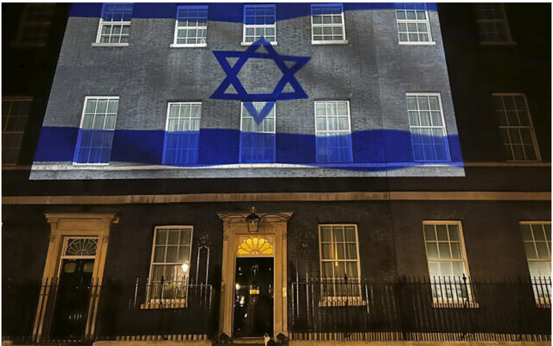
The flag of Israel is projected onto the front of 10 Downing Street in London, October 8, 2023, to show solidarity with Israel.

A spokesperson for British Prime Minister Rishi Sunak says Sunak has spoken with Prime Minister Benjamin Netanyahu and offered any support Israel needs.