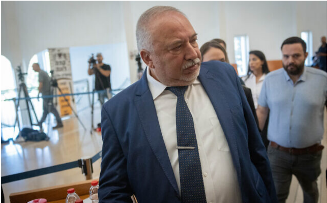
Yisrael Beytenu party leader MK Avigdor Liberman arrives to a court hearing on petitions against a government law at the Supreme Court in Jerusalem, September 28, 2023.

Yisrael Beytenu chairman and former defense minister Avigdor Liberman says he will join the current government if Prime Minister Benjamin Netanyahu — together with the defense minister and IDF chief of staff — “stand in front of the cameras and inform the Jewish people” that the government intends to