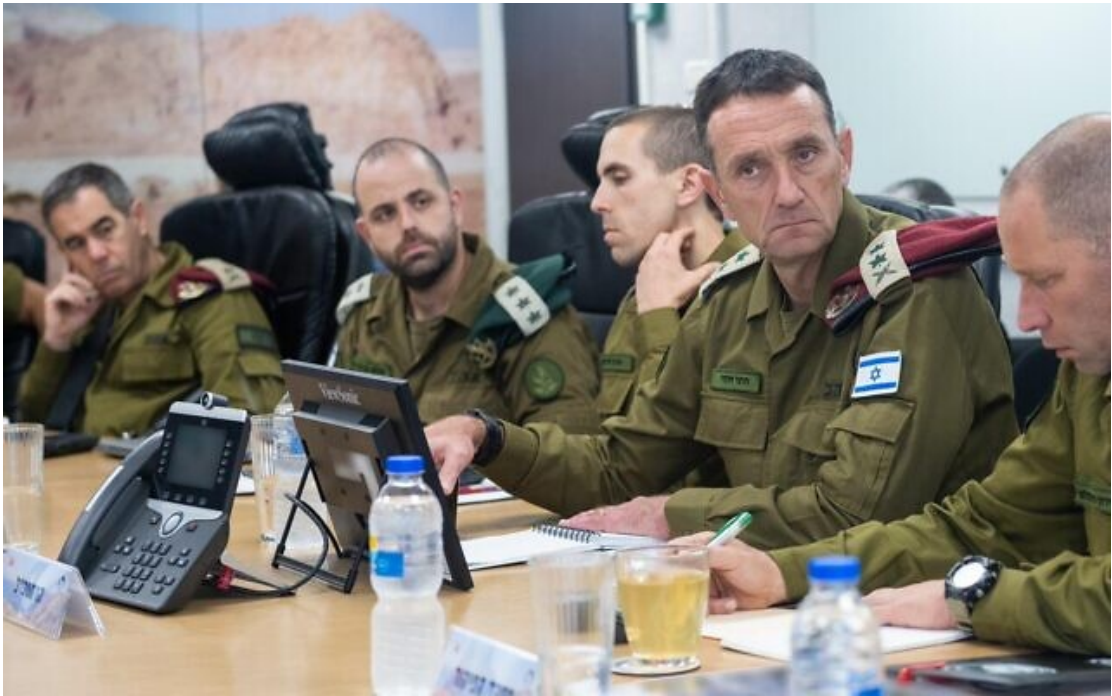
IDF Chief of Staff Lt. Gen. Herzi Halevi holds an assessment at the IDF Southern Command in Beersheba, October 8, 2023.

The chief of the Israel Defense Forces issues his first public comments since Hamas launched its attack against Israel yesterday morning.