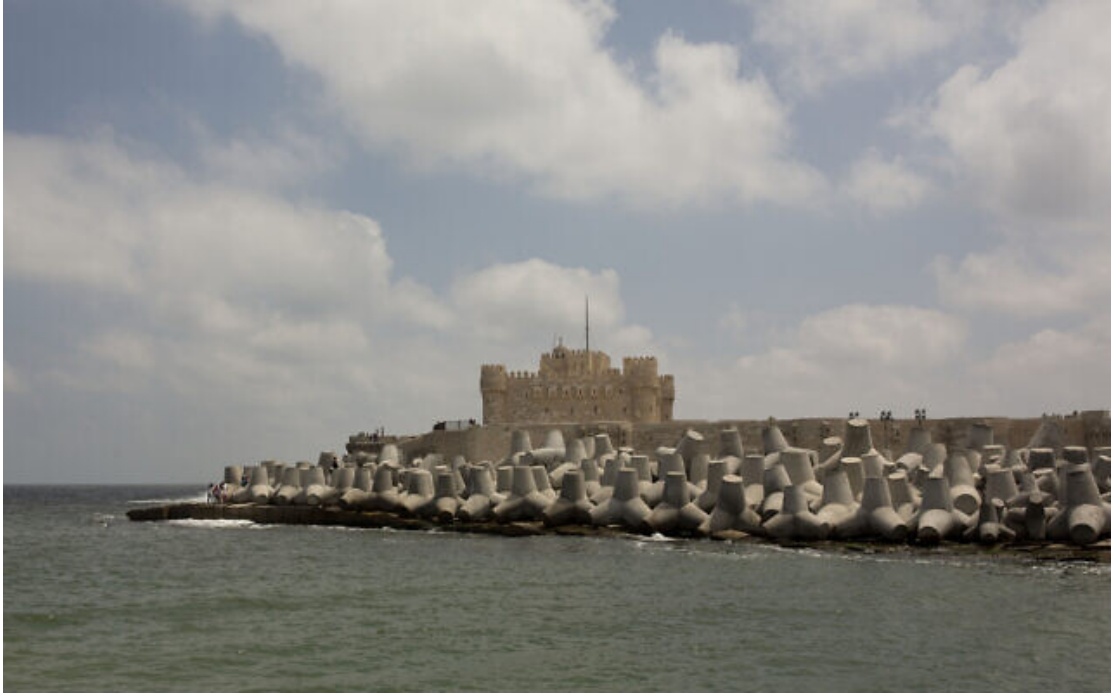
An Aug. 8, 2019 photo of Alexandria, Egypt.

At least one Israeli has been killed when a gunman opened fire on a bus full of Israeli tourists in Egypt, according to Hebrew and Arabic media reports.