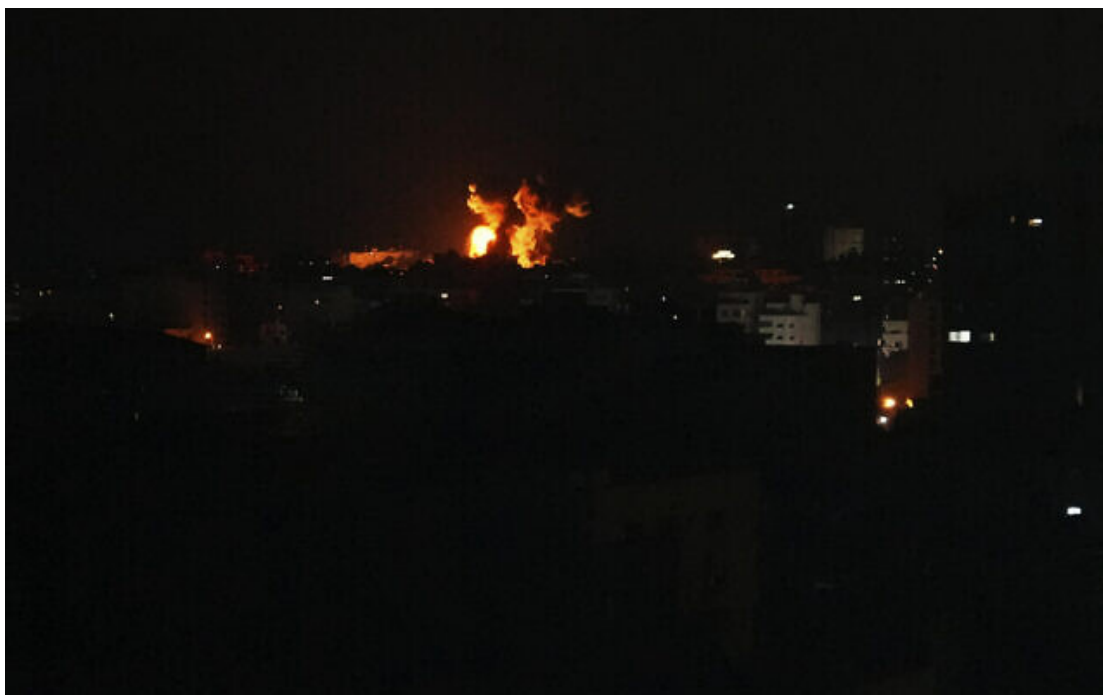
Fire and smoke rise from an explosion following an Israeli air strike in Gaza City, October 8, 2023.

The Israel Defense Forces says it launched massive airstrikes against the Shuja'iyya neighborhood of Gaza City, targeting some 150 sites.