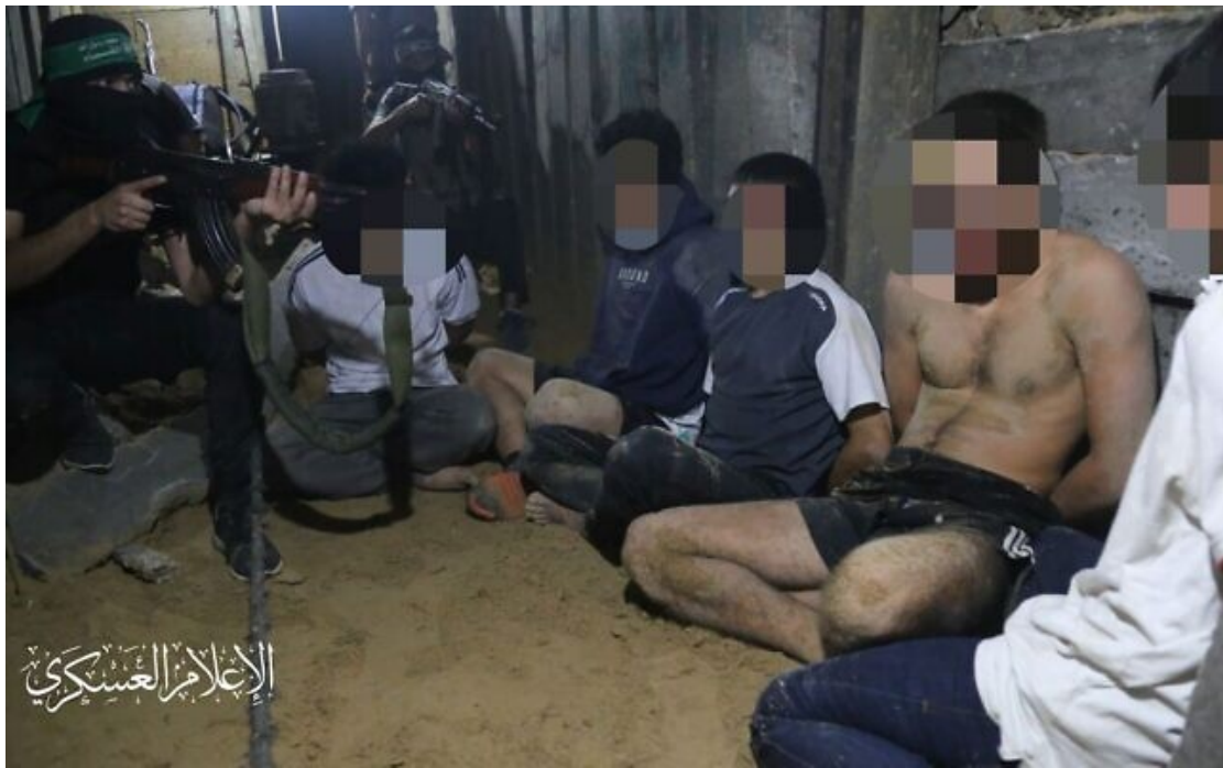
Foreign nationals being held by Hamas gunmen, in an unconfirmed photo distributed on social media. (Used in accordance with Clause 27a of the Copyright Law)

The Foreign Ministry of Thailand says 11 of its nationals were taken hostage during the fighting in southern Israel and presumably brought to Gaza.