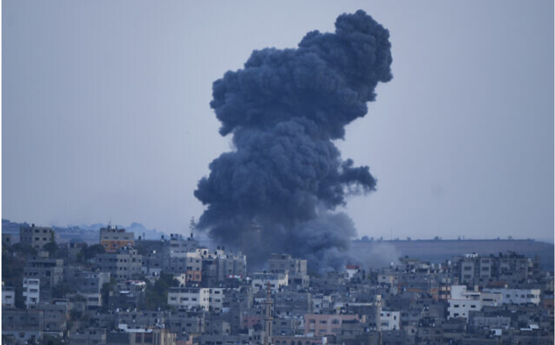
Smoke rises following an Israeli airstrike, in Gaza City, October 8, 2023.

The Israel Defense Forces says it struck a Hamas tunnel built underneath a high-rise tower in the northern Gaza Strip.