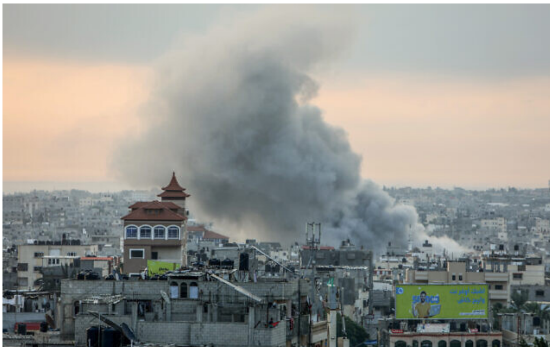
Smoke rises after Israeli air strikes near the border east of the city of Rafah in the southern Gaza Strip, October 8, 2023.

The Hamas-run health ministry in the Gaza Strip says 370 Palestinians have been killed and another 2,200 have been wounded in the Gaza Strip.