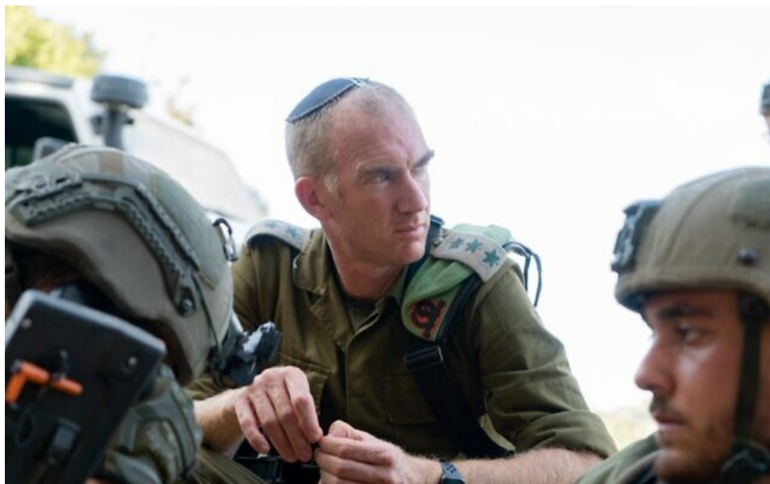
Col. Jonathan Steinberg, the commander of the Nahal Brigade, in an undated photo

The Israel Defense Forces publishes the names of 26 soldiers killed during fighting with Hamas terrorists on the border with the Gaza Strip during the past day. Their families have been notified.