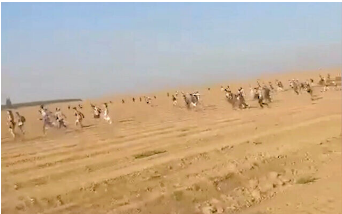
Hundreds flee gunmen at a music festival near Kibbutz Re'im, October 7, 2023.

A spokesperson for ZAKA, a volunteer group that handles human remains after terror attacks and other disasters, tells Hebrew media outlets that it has so far collected more than 250 bodies from the site of a music festival in the south, which was attacked by Hamas terrorists.