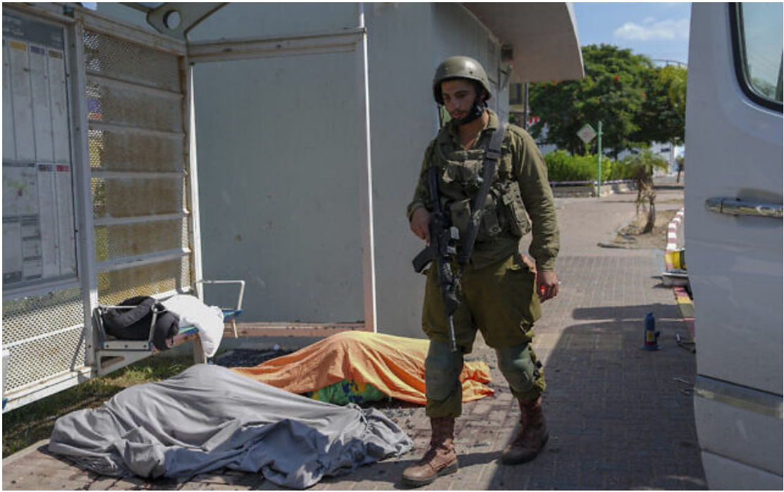
An Israeli soldier stands by the bodies of people killed by Palestinian terrorists who entered from the Gaza Strip, in the southern Israeli city of Sderot, October 7, 2023.

Ten citizens of Nepal are among those killed in the Hamas assault on Israel, the Himalayan republic's embassy in Tel Aviv says in a statement.