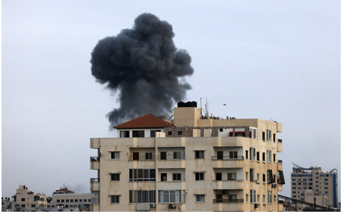
A plume of smoke rises above buildings in Gaza City during an Israeli air strike, on October 8, 2023.

The Israel Defense Forces says it struck two high-rise towers in the Gaza Strip containing Hamas assets.