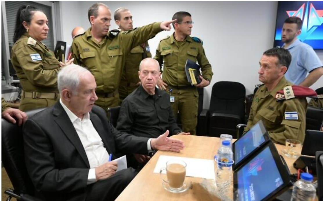
Prime Minister Benjamin Netanyahu (L) meets with Defense Minister Yoav Gallant (C) and military chiefs at IDF headquarters in Tel Aviv for a security assessment on October 8, 2023.

The security cabinet voted last night to put the country officially at war, and it can carry out "significant military activities," the Prime Minister's Office announces.