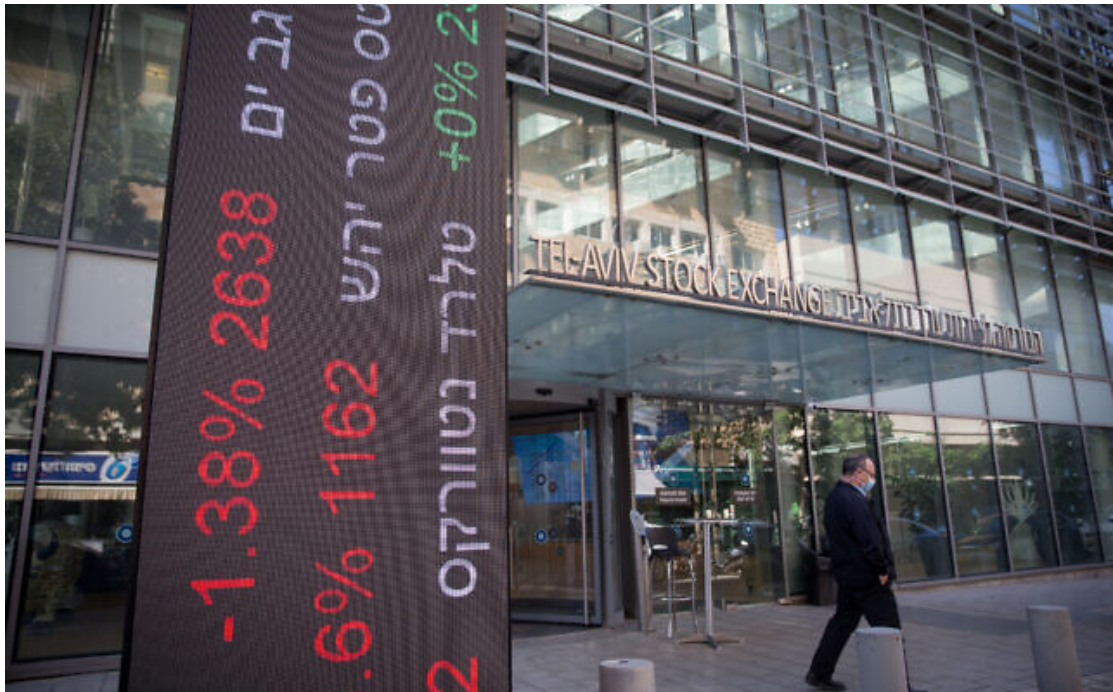
Illustrative: View of the Tel Aviv Stock Exchange, November 29, 2020.

The Tel Aviv Stock Exchange plunges as investors brace for uncertain times on the day after an unprecedented surprise attack on Israel was launched from Gaza by the Hamas terror group.