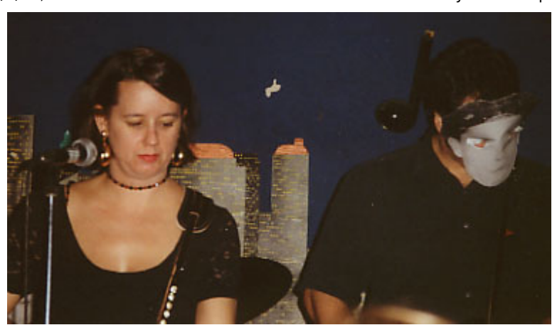
Topper and Spingo.